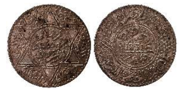
826956. MOROCCO: AR 10 dirhams (24.95g), Paris, AH1331, Y-33, choice ef $$225