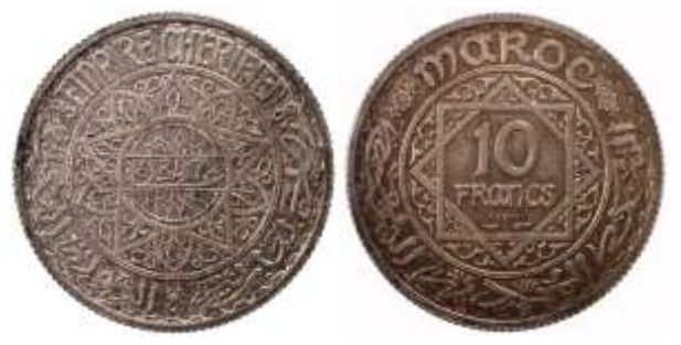
826961. MOROCCO: AR 10 francs (10.04g), Paris, AH1347 (a), Y-E23, Essai of Y-38, unc $300