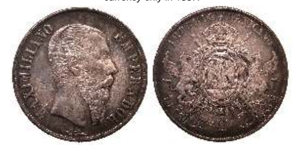
826927. MEXICO: Maximilian, AR pes0 (27.16g), 1866 Mo, KM-388.1, vf-ef $100

The pillar dollar, "ocho reales", struck at the Spanish colonial mints in South and Central America from 1732 to 1771, has always been on the most popular coins amongst collectors in the United States, as together with the portrait dollar of Spanish America it became the standard currency of the United States. Technically, the United States dollar replaced the Mexican eight real coins as the US official currency only in 1857.