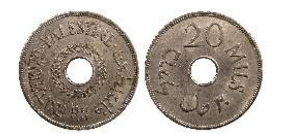
89365. PALESTINE: 20 mils, 1941, KM-5, key date, ef-au

826971. NETHERLANDS EAST INDIES: tin duit (7.42g), Negapatnam, 1797, KM-179, struck for use in Java, vf $350