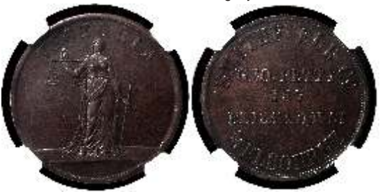
92659. AUSTRALIA: AE penny, Melbourne, ND (c. 1860), KM-TN197.1, George Petty, Smithfield Co., lovely chocolate brown luster, NGC graded AU58 BN (=brown) $700

82907. ARMENIA: Levon I, 1198-1219, AR tram (2.90g), king seated / two lions back to back, Ner-286v, lightly toned ef $110