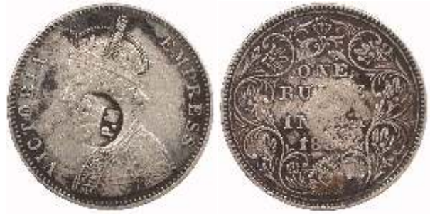
90177. MOZAMBIQUE: AR rupee, ND [1889], KM-41.2, crowned PM countermarked on British India 1888-B rupee, vf $150