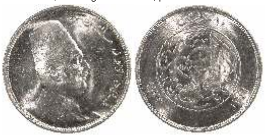
89282. EGYPT: AR 10 girsh, 1923-H/AH1342, KM-337, unc