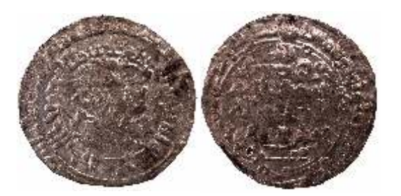
86984. SAMANID: Nuh III, 976-997, AR dirham (3.85g), Balkh, AH374, A-1470, SNAT-—, with title al-malik al-mansur on obverse, muhammad on reverse, traces of original lustre, choice ef $100

87961. SAMANID: Nuh III , 976-997, AR dirham (3.78g), Samarqand, AH367, A-1470, SNAT-865, citing Makki below obverse, allegedly referring to a governor from Makka in Arabia, bold mint & date, choice vf, R $150