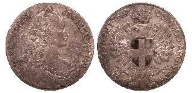
93563. ERITREA: AR tallero, 1918-R, KM-5, one year type, ef-au $425

82868. ENGLAND: Charles I , 1625-1649, AR halfcrown, Tower mint, ND, S-2717, N-2209, king on horse left / Shield of arms, mintmark above, centered on irregular flan, f $185