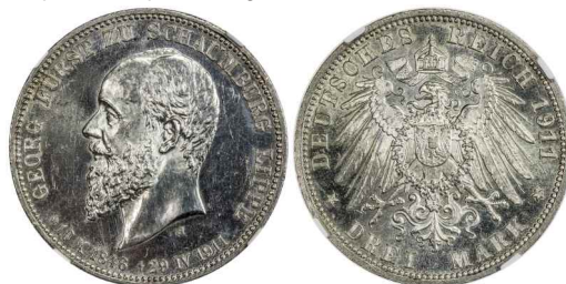
782. SCHAUMBURG-LIPPE: AR 3 mark , 1911-A, Y-206, Death of the Prince, surface hairlines, prooflike fields, NGC graded UNC details $200 - 250