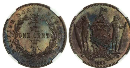
613. BRITISH NORTH BORNEO: cent, 1888-H, KM-2, delightful iridescent toning, Heaton Mint specimen strike, NGC graded Specimen 64 Brown $160 - 200