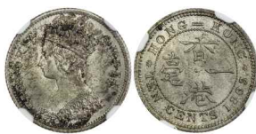
597. HONG KONG: Victoria , 1841-1901, AR 10 cents, 1863, KM-6.1, NGC graded MS64 $200 - 250