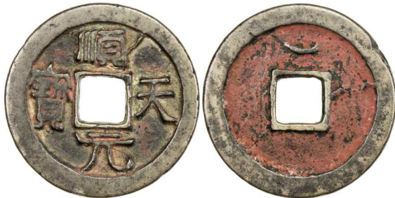
510. XIN: Shun Tian , rebel, 759-761, AE 100 cash (18.02g), H-14.140, crescent above on reverse, VF $175 - 225

Shi Siming (Shun Tian) was a general of the Tang Dynasty who followed his childhood friend An Lushan in rebelling against Tang, and who later succeeded An Lushan's son An Qingxu as emperor of the Yan state that An Lushan had established. He was killed by his own troops in the spring of 761.