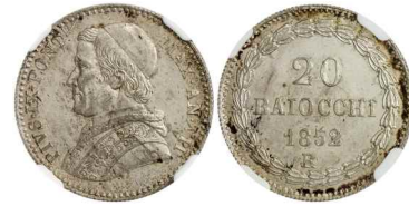
839. ROMAN STATES: Pius IX , 1846-1878, AR 20 baiocchi, 1852-R anno VII, KM-1337, NGC graded MS65 $150 - 200