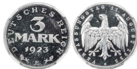
789. GERMANY: Weimar Republic, 3 mark, 1923, KM-29, 3rd Anniversary Weimar Constitution, NGC graded PF64 Ultra Cameo $80 - 100