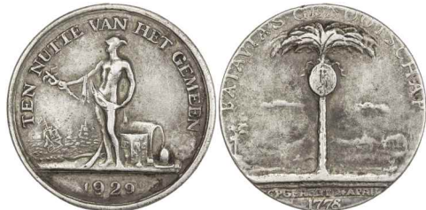
693. NETHERLANDS EAST INDIES: AR medal, 1929, 30mm, TEN NUTTE VAN HET GEMEEN above god Mercury left, Dutch East Indianmen at sail at left, goods with VOC balemark at right // BATAVIA'S GENOOTSCHAP above palm tree and native scene, with date 24 April 1778 in exergue, VF $75 - 100