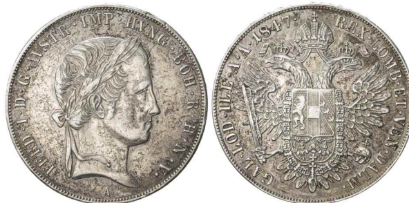
722. AUSTRIA: Ferdinand I , 1835-1848, AR thaler, Vienna, 1847-A, KM-2240, Dav-14, pleasant toning, EF $80 - 100