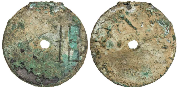
499. WARRING STATES: State of Liang , 350-220 BC, AE cash (10.07g), H-6.3, round central hole, yuan at right in archaic script, F-VF $100 - 125