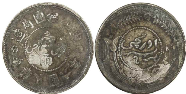
575. SINKIANG: AR sar (tael) (35.41g), Urumqi (Tihwa), year 6 (1917), Y-45, L&M-837, 5-point rosette atop the wreath, stained, decent VF $100 - 140