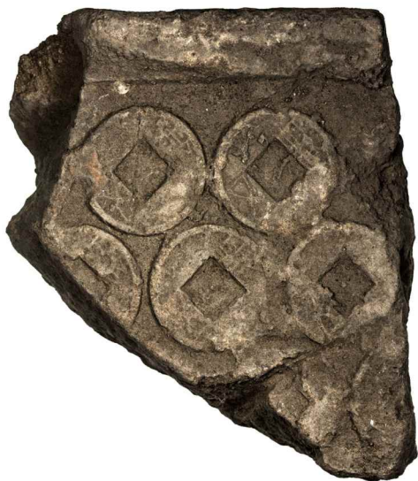
508. WESTERN HAN: Anonymous , BC 206-AD220, clay coin mold, H-10, 90mm x 117mm, part of a clay mold for wu zhu coins, three full and three partial impressions, F-VF, S $100 - 150