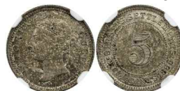
702. STRAITS SETTLEMENTS: Victoria, 1837-1901, AR 5 cents, 1885, KM-10, NGC graded MS63 $200 - 250