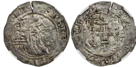
841. RHODES: Philibert of Naillac , 1396-1421, AR gigliato, Metcalf-1219, Grandmaster kneeling left holding cross, shield to right // cross fleury with shield at end of each arm, actually "almost uncirculated", without any wear or damage, just one flan crack, NGC graded F15 $100 - 120