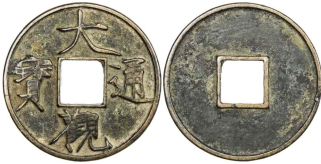
516. NORTHERN SONG: Da Guan , 1107-1110, AE 10 cash (16.56g), H-16.426, slender golden script, VF $75 - 100