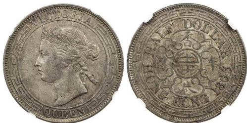
598. HONG KONG: Victoria , 1841-1901, AR half dollar, 1866, KM-8, NGC graded AU55 $700 - 900