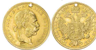
723. AUSTRIA: Franz Joseph I , 1848-1916, AV ducat (3.46g), 1915 (restrike), KM-2267, countermarked sword within wreath, all within incuse oval, on obverse, to confirm gold content for trade in Yugoslavia, pierced, AU $120 - 140