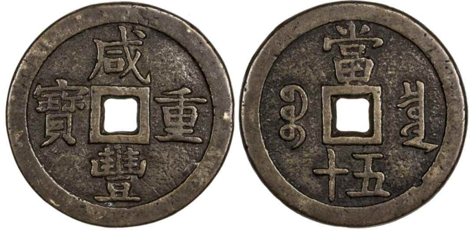
529. QING: Xian Feng , 1851-1861, AE 50 cash, Board of Revenue mint, Peking, H-22.702, 56mm, East branch mint, brass ( huáng tóng ) color, cast June 1853 to February 1854, VF $100 - 150