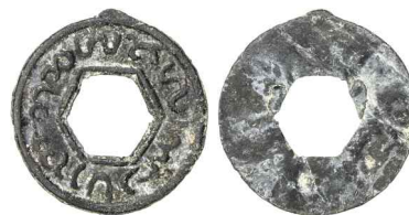
645. SIAK: tin pitis (2.35g), inscription in very corrupt Sumatran-Javanese "Sultan Siyak" imitating Banten (Bantam) issues with hexagonal central hole, VF-EF $75 - 100

Michael Mitchiner has read the text as "Sultan Siyak" in Javanese script. He dates the coin as circa 1610 to the 1620's. After examining many of these tin issues, we could not find another published similar example online of this inscriptional variety.