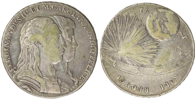
834. NAPLES: Ferdinando IV , 1759-1799, 1799-1805, AR 120 grana, 1791, KM-213, Dav-1408, initials P/AP-M, "Zodiac piastre", one-year type, Fine $200 - 250