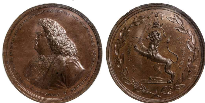
865. RUSSIAN EMPIRE: Peter I, the Great, 1682-1725, AE medal, [1698], Diakov-10.2, 57mm medal honoring Count Feodor Alexeevich Golovin, unsigned copy by J.C. Hedlinger, wiggled half-length bust of Golovin left // crowned rampant lion, holding sword, within laurel wreath, a well struck example with bold relief and brilliant chocolate brown luster, NGC graded MS64 BR, Photo size reduced $850 - 950