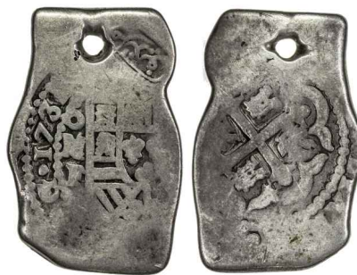
646. SUMENEP: AR 8 real batu (23.77g), KM-197, 27mm x 42mm, Madura Island, struck upon pierced host Mexico cob 8 Reales 173x, Fine, ex Ponterio & Associates Auction COIN '88, Lot 0223 (May 27-28, 1988) $250 - 350