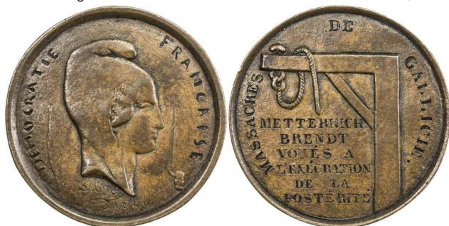
860. POLAND: AE medal (17.20g), Collignon-1427, 40mm, designed by David d'Angers, for the massacre at Galicia by Metternich's troops, EF $100 - 120