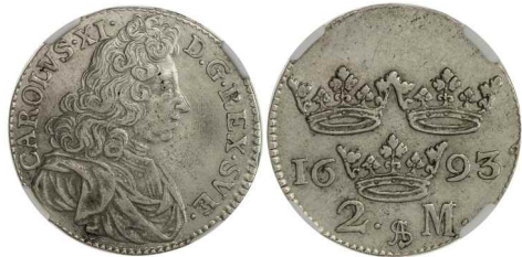
957. SWEDEN: Karl XI, 1670-1697, AR 2 mark (Stockholm), 1693, KM-282.1. NGC graded AU55 $150 - 180