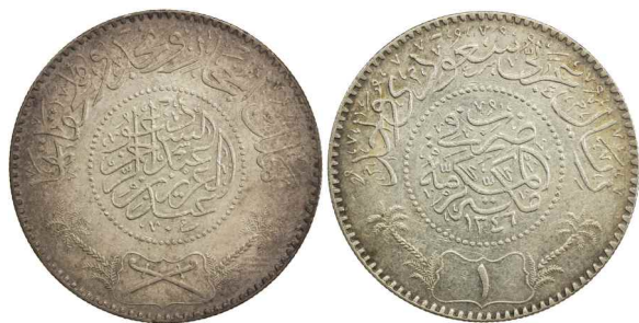
640. HEJAZ & NEJD: 'Abd al-'Aziz b. Sa'ud , 1926-1953, AR riyal, Makka al-Mukarrama (Mecca), AH1346, KM-12, attractive obverse colorful toning, EF $180 - 200