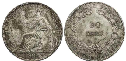
633. FRENCH INDOCHINA: AR 20 cents, 1895-A, KM-3a, Lec-195, by far the finest known specimen of the 20 cents dated 1895 (both types), razor sharp strike with light iridescent toning, PCGS graded MS66 Secure Holder, RR $2,750 - 3,250

Although the design & privy marks were unchanged, the slight reduction in weight (5.443g to 5.40g) meant that the heaviest issues were hoarded and the lighter used in general circulation. The more common type 1 1895-A sold at an auction in 2013 for $2585, but it was only MS63 by NGC (one MS64 is also known, only this piece higher).