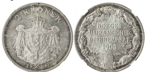
859. NORWAY: Haakon VII, 1905-1957, AR 2 kroner, 1907, KM-365, Independence Commemorative, golden toning towards the rims, NGC graded MS65 $250 - 350