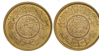
700. SAUDI ARABIA: 'Abd al-'Aziz b. Sa'ud, 1926-1953, AV guinea, AH1370, KM-36, AGW 0.2354 oz, NGC graded MS66 $300 - 350