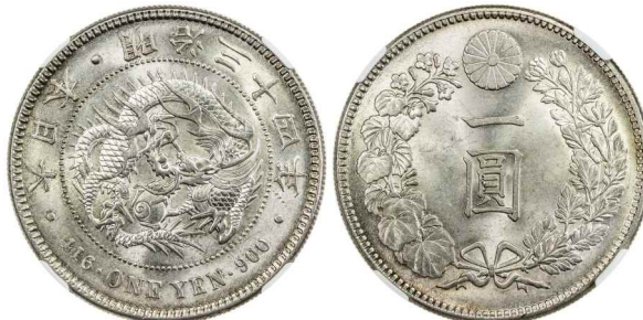
666. JAPAN: Meiji , 1897-1912, AR yen, year 34 (1901), Y-A25.3, NGC graded MS65 $130 - 170