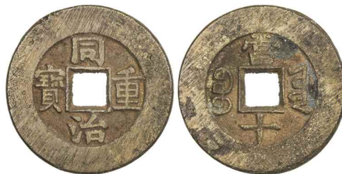
544. QING: Tong Zhi , 1862-1874, AE 10 cash (11.02g), Board of Works mint, Peking, H-22.1133, New branch mint, possible sample cash or yàng qián , EF $200 - 300