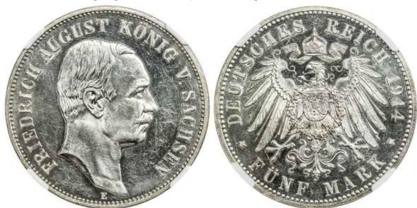
776. SAXONY: Friedrich August III , 1904-1918, AR 5 mark, 1914-E, Y-195, brilliant prooflike fields, NGC graded MS62 $175 - 225