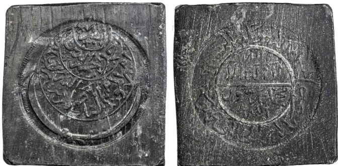
717. YEMEN: Ahmad , 1948-1962 (112g), San'a, AH1375, KM—, square lead klippe trial strike for a gold or silver riyal (as Y-G17 or Y-17), 48x48mm, 4mm thick, presumably for die pair test, crudely struck as one would expect, EF $600 - 800

Nearly as struck with glossy dark patina appropriate for age with no corrosion; highly attractive. Completely unpublished, presumably unique as a klippe.