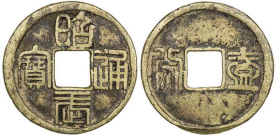
528. NAN MING: Zhao Wu , 1678, AE 10 cash (9.34g), H-21.111, seal script, yi fen on reverse, Fine $75 - 100