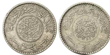
639. HEJAZ & NEJD: 'Abd al-'Aziz b. Sa'ud, 1926-1953, AR 1/4 riyal (5.93g), Makka al-Mukarrama (Mecca), AH1346, KM-10, VF-EF $110 - 150