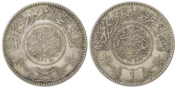
642. HEJAZ & NEJD: 'Abd al-'Aziz b. Sa'ud , 1926-1953, AR riyal (23.77g), Makka al-Mukarrama (Mecca), AH1348, KM-12, pleasing VF-EF $180 - 220