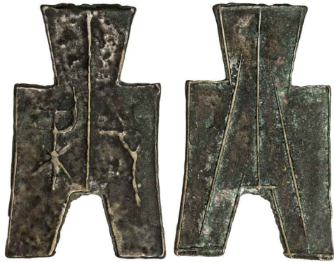
497. WARRING STATES: State of Liang , 350-250 BC, AE spade money (10.51g), H-3.225, flat handle square foot spade type, liang in archaic script, large size flan, F-VF $100 - 150