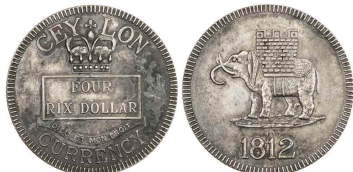
631. CEYLON (FANTASY): AR four rix dollar (10.04g), "1812", KM-X6, unusual fantasy coin, attractively toned, KM lists a mintage of 200 pieces, AU, R $350 - 400