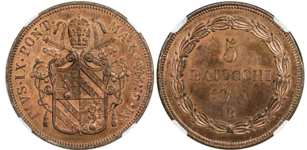
840. ROMAN STATES: Pius IX , 1846-1878, AE 5 baiocchi, 1854-R anno IX, KM-1356, a superb example! NGC graded MS65 RB $200 - 250