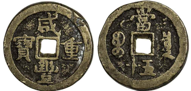
531. QING: Xian Feng , 1851-1861, AE 50 cash, Board of Revenue mint, Peking, H-22.716, 41mm, Prince Qing Hui mint, 'sun & moon' above, cast May-August 1854, brass ( huáng tóng ) color, crude VG-F $75 - 100