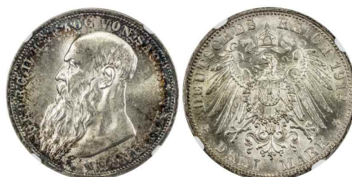
779. SAXE-MEININGEN: AR 3 mark , 1913-D, Y-162, a lovely example! NGC graded MS64 $325 - 375