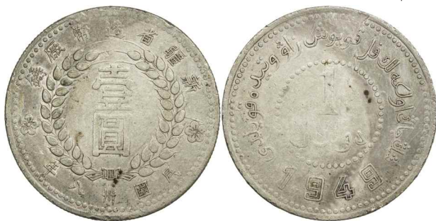
576. SINKIANG: Republic, AR dollar, 1949, Y-46.2, L&M-842, pointed base 1 variety, uneven strike, VF $100 - 150