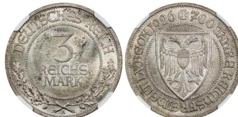
790. GERMANY: Weimar Republic, AR 3 mark, 1926-A, KM-48, 700 Years of Freedom for Lubeck, NGC graded MS64 $200 - 250