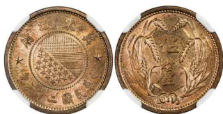
579. EAST HOPEI: AE 5 li, year 26 (1937), Y-516, a lovely example! NGC graded MS65 RB $180 - 220