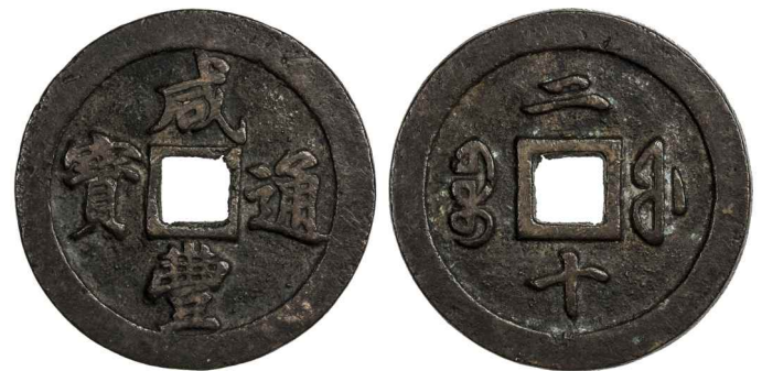
536. QING: Xian Feng , 1851-1861, AE 20 cash (34.52g), Fuzhou, Fujian Province, H-22.781, 46mm one dot tong, copper ( tóng ) color, cast 1853-55, VF $75 - 100