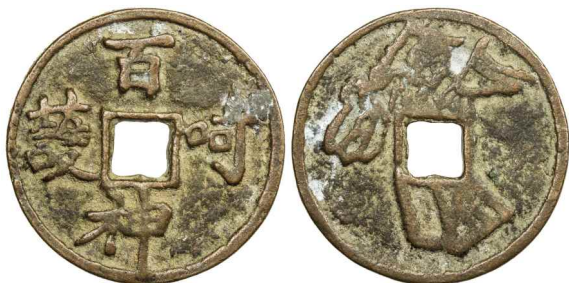
557. QING: AE charm (13.42g), CCH-1813, 36mm, bai shén he hù // god standing left, VF, S $75 - 100

Very rare charm from Guizhou Province. Photo size reduced.