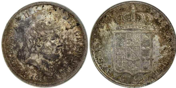
836. NAPLES & SICILY: Ferdinando II , 1830-1859, AR 120 grano, 1855, KM-370, Dav-175, mottled toning in various colors, PCGS graded MS63 $240 - 280