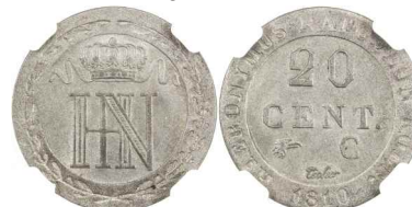
784. WESTPHALIA: Jérôme Bonaparte , 1807-1813, BI 20 centimes, 1810, Cr-26, NGC graded MS63 $120 - 140