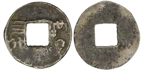
500. WARRING STATES: State of Qi , 300-200 BC, AE cash (4.44g), H-6.24, yi si hua ([City of] Yi, four hua) in archaic characters, F-VF $100 - 150