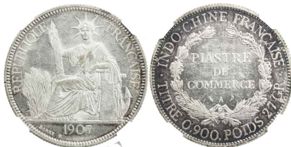
635. FRENCH INDOCHINA: AR piastre, 1907-A, KM-5a.1, NGC graded MS60 $100 - 140