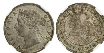
704. STRAITS SETTLEMENTS: Victoria, 1837-1901, AR 20 cents, 1891, KM-12, NGC graded MS64 $200 - 300

The only example in mint state graded at NGC as of July 2017. The next highest graded example is AU58.