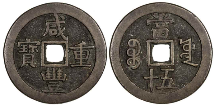
533. QING: Xian Feng , 1851-1861, AE 50 cash (60.21g), Board of Works mint, Peking, H-22.759, 55mm, Old branch mint, cast November 1853 to March 1854, large size, brass ( huáng tóng ) color, a lovely example! VF-EF $100 - 200