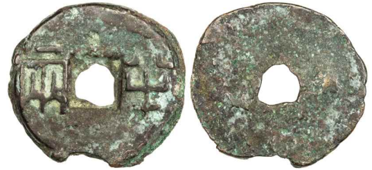
502. WARRING STATES: State of Qin , 350-300 BC, AE cash (15.58g), H-7.4, ban liang , heavy early issue, natural casting defect, F-VF $100 - 150