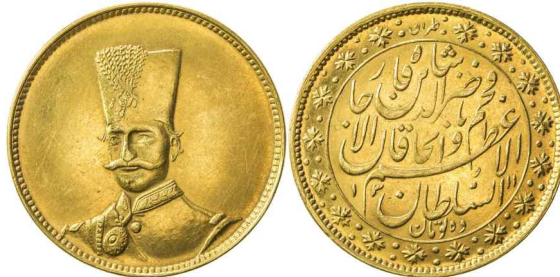
649. IRAN: Nasir al-Din Shah , 1848-1896, AV 10 toman (28.95g), AH1311, KM-945, Fr-59, facing portrait of the Shah // royal text, which translates to "the esteemed sultan and supreme khaqan Nasir al-Din Shah Qajar", with denomination dah toman below, AU, RR $5,000 - 6,000