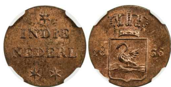
692. NETHERLANDS EAST INDIES: AE duit, 1836, KM-Pn20, swan in shield, NGC graded MS64 RB $130 - 170