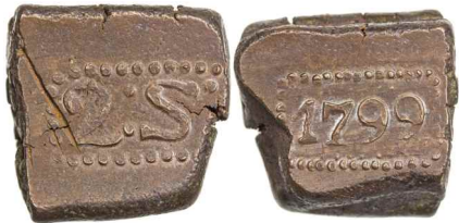
644. JAVA: AE 2 stuiver (41.66g), 1799, KM-181, struck on somewhat irregular square flan, EF-AU, R $200 - 300