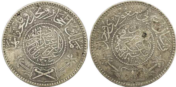
643. HEJAZ & NEJD: 'Abd al-'Aziz b. Sa'ud , 1926-1953, AR riyal (23.91g), Makka al-Mukarrama (Mecca), AH1348, KM-12, strong VF $150 - 200