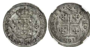
861. PORTUGAL: Miguel, 1828-1834, AR 60 reis, ND, KM-382, beautiful steel grey toning, NGC graded MS66+ $150 - 200