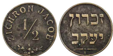
695. OTTOMAN PALESTINE: Zichron Jacob, after 1885, brass ½ piastre (3.33g), Haffner-CC.17B, 23mm, name in English on one side, in Hebrew on the other side, minor discoloration, decent VF $350 - 450