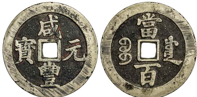
542. QING: Xian Feng , 1851-1861, AE 100 cash (58.93g), Chengdu, Sichuan Province, H-22.981, 56mm, cast in 1854-55, VF $75 - 100