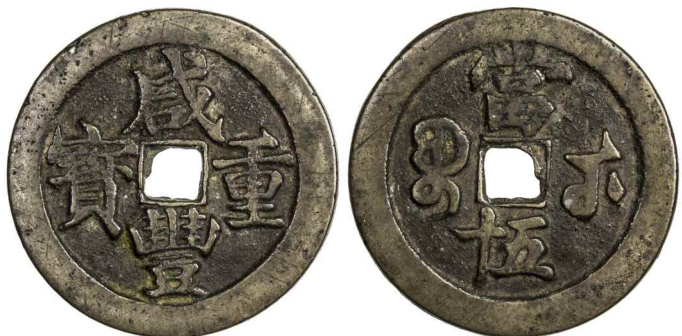
539. QING: Xian Feng , 1851-1861, AE 50 cash, Wuchang mint, Hubei Province, H-22.867, 49mm, large bold characters, six stroke bei , cast 1854-56, VF $100 - 150