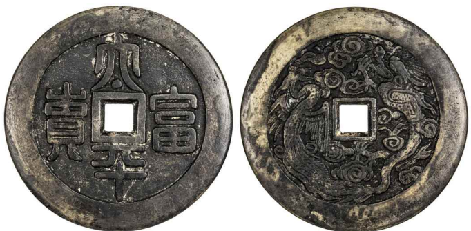
556. QING: AE charm, CCH-1090, 99mm, tài píng fù guì (May you have peace, wealth and honor) in seal script // dragon & phoenix, VF, RRR, ex Wéiduoliya Collection , ex Stephen Album Rare Coins Auction 24, Lot 1149 $1,000 - 1,200

Possibly cast in late Qing or early Min Guo era. Photo size reduced.