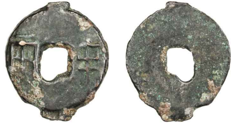
503. WARRING STATES: State of Qin , 350-200 BC, AE cash (10.19g), H-7.4, ban liang , denglong "lantern" type with top and bottom casting spurs intact, F-VF $75 - 100