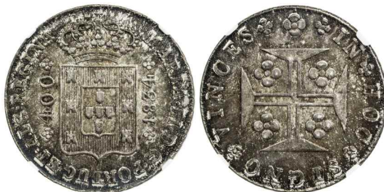
862. PORTUGAL: Maria II, 1834-1853, AR 400 reis, 1834, KM-403.2, deep iridescent toning, NGC graded MS64 $150 - 200