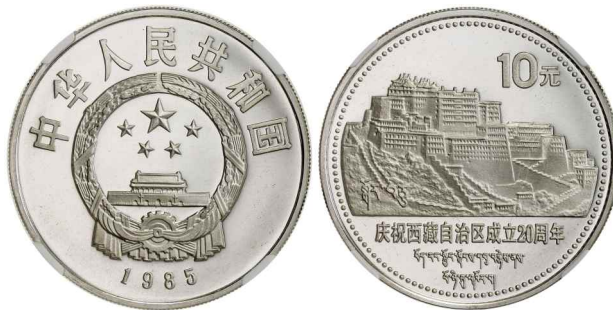
582. CHINA (PEOPLE'S REPUBLIC): AR 10 yuan, 1985, KM-127, Potala Palace, 20th anniversary of Tibetan autonomy, legends in both Chinese & Tibetan, mintage of 3,000 only, NGC graded PF69 UC $700 - 800