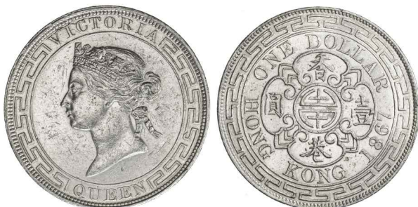
600. HONG KONG: Victoria , 1841-1901, AR dollar (26.96g), 1867, KM-10, lovely strike, with the usual small nicks, AU $700 - 900