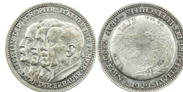
793. GERMANY: Weimar Republic, AV medal (6.53g), 1929, Kaiser-511.3, 23mm, medal for the round-the world flight of the Graf Zeppelin, three side-by-side busts left with. ZEPPELIN DER SCHÖPFER. ECKENER DER FÜHRER. DÜRR DER ERBAUER. around // globe with landing ports and dates with I. WELTFAHRT DES LUFTSCHIFFS "GRAF ZEPPELIN". 1929. around, PREUSS. STAATSMÜNZEN GOLD 18 KAR. on edge, toned AU-UNC $275 - 350

Though this item has the appearance of silver, it is stamped "GOLD 18 KAR" on the edge.