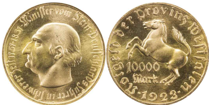
786. WESTPHALIA: AE 10000 mark, 1923, Menzel-26666.17, Lamb-579.7, Jaeger-N20b, gilt bronze issue, fantastic full luster, NGC graded MS65 $80 - 100