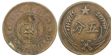
580. CHINESE SOVIET REPUBLIC: AE 5 cents, ND (1932), Y-507, original strike, issue of the Kiangsi Soviet, reeded edge, pleasing EF, S $75 - 100