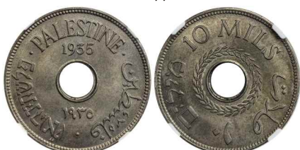
697. PALESTINE: 10 mils, 1935, KM-4, NGC graded MS64 $120 - 160

These tokens were struck in Paris in 1885, for use as small change in this settlement, and also used as small change in Jaffa, Haifa and in the nearby Arab settlements due to the lack of Ottoman copper coins.