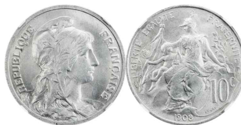
756. FRANCE: 10 centimes essai, 1908, KM-E40, Mazard-2181, essai in aluminum of KM-843, NGC graded MS65, R2 (Mazard) $400 - 700