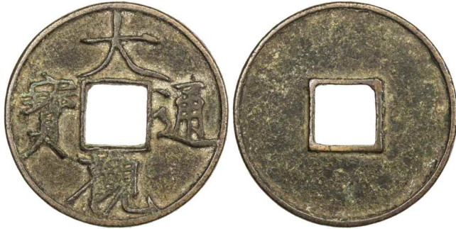
517. NORTHERN SONG: Da Guan , 1107-1110, AE 10 cash (16.56g), H-16.426, slender golden script, VF $75 - 100