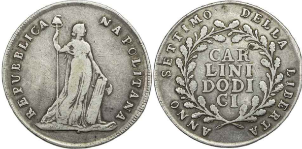
835. NEAPOLITAN REPUBLIC: AR 12 carlini (27.21g), year 7 (1799), Cr-84.2, Dav-1410, very attractive F-VF $300 - 400