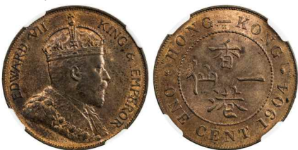
601. HONG KONG: Edward VII , 1901-1910, AE cent, 1904-H, KM-11, NGC graded MS63 RB $140 - 180