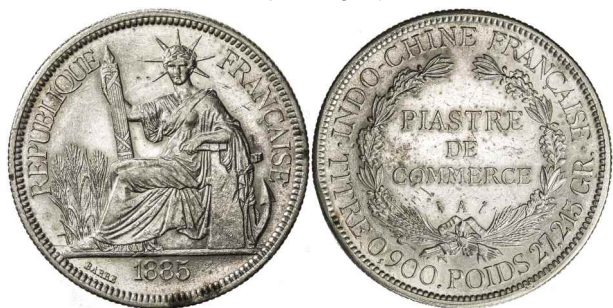
634. FRENCH INDOCHINA: AR piastre, 1885-A, KM-5, scarce date, AU $200 - 250

Although the design & privy marks were unchanged, the slight reduction in weight (5.443g to 5.40g) meant that the heaviest issues were hoarded and the lighter used in general circulation. The more common type 1 1895-A sold at an auction in 2013 for $2585, but it was only MS63 by NGC (one MS64 is also known, only this piece higher).