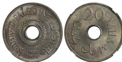
698. PALESTINE: 20 mils, 1935, KM-5, NGC graded MS64 $150 - 200