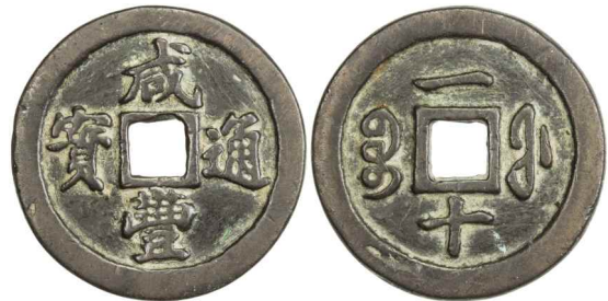
535. QING: Xian Feng , 1851-1861, AE 10 cash (18.04g), Fuzhou, Fujian Province, H-22.780, one dot tong, copper ( tóng ) color, cast 1853-55, VF $75 - 100