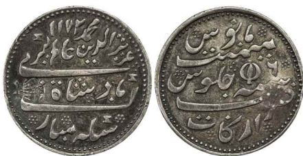
630. CEYLON: George IV, 1820-1830, AR 1-1/3 rixdollar (16 fanams), ND [1823], KM-86, countermarked crown on Madras Presidency Arcot rupee, EF, R $1,800 - 2,000