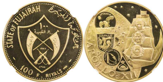
637. FUJAIRAH: Muhammad bin Jamad al-Sharqi, 1952-1969, AV 100 riyals, AH1388//1969, KM-10, Apollo XII commemorative, arms // three logos on moon at left, three portraits superimposed on sailing ship at right, authorized mintage of only 3,040 pieces, NGC graded Proof 66 Ultra Cameo, S $900 - 1,100

Apollo XII was the second manned flight to land on the moon and the sixth overall of the Apollo program. It was launched four months after the Apollo XI flight.