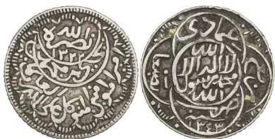
716. YEMEN: Yahya b. Muhammad , 1904-1948, AR ¼ imadi riyal, San'a, AH1343, Y-10, nice strike, rare date, VF $80 - 100