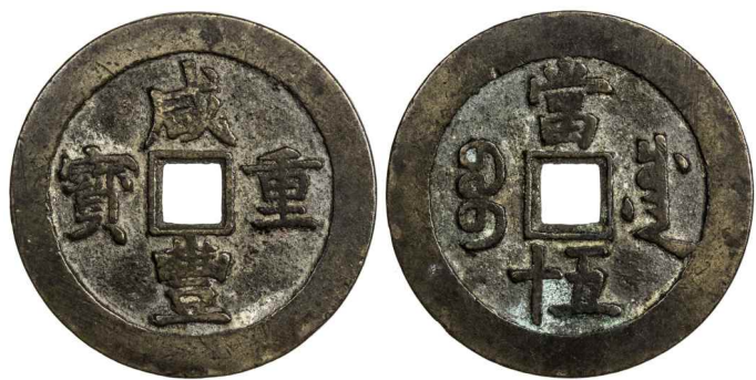
541. QING: Xian Feng , 1851-1861, AE 50 cash, Chengdu mint, Sichuan Province, H-22.980, 51mm, brass ( huáng tóng ) color, cast 1854-55, VF $75 - 100