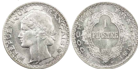
636. FRENCH INDOCHINA: AR piastre, 1931(a), KM-19, one year type, Choice UNC $75 - 100