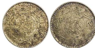
638. HEJAZ & NEJD: 'Abd al-'Aziz b. Sa'ud, 1926-1953, AR 1/4 riyal (5.97g), Makka al-Mukarrama (Mecca), AH1346, KM-10, lovely AU $140 - 180

Apollo XII was the second manned flight to land on the moon and the sixth overall of the Apollo program. It was launched four months after the Apollo XI flight.