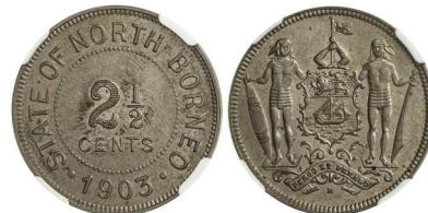
614. BRITISH NORTH BORNEO: 2½ cent, 1903-H, KM-4, Heaton Mint specimen strike, NGC graded Specimen 64 $150 - 200