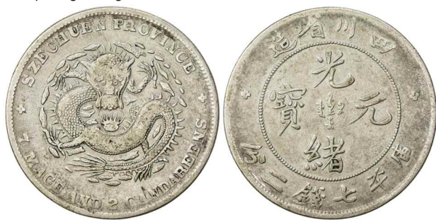
578. SZECHUAN: Kuang Hsu, 1875-1908, AR dollar (26.14g), ND (1901-1908), Y-238.2, L&M-345A, side headed dragon, VF $140 - 180