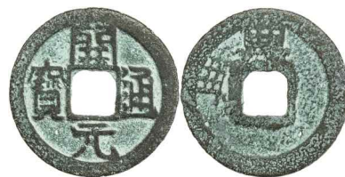
512. TANG: Kai Yuan , 845-846, AE cash (3.01g), Xingyuan mint, Shaanxi Province, H-14.81, huichang type, double casting error on reverse, VF $75 - 100