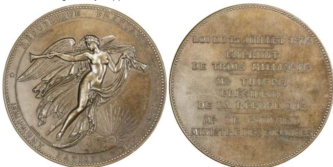
753. FRANCE: AE medal (132.5g), 1872, 68mm bronze medal for the Loan to the Republic by Alphée Dubois, Victory with drapery holding trumpet with left hand and blowing a second trumpet with the right, aloft above earth with radiant sun rising in background and RÉPUBLIQUE FRANÇAISE * EMPRUNT NATIONAL DE 1872 * around // LOI DU 15 JUILLET 1872 / (line) / EMPRUNT / DE TROIS MILLIARDS / (line) / Mr. THIERS / PRÉSIDENT / DE LA RÉPUBLIQUE / (line) / Mr. DE GOULARD / MINISTRE DES FINANCES , CUIVRE and privy mark on edge, wonderful chocolate color, AU, S $200 - 250