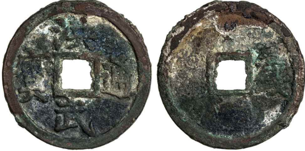
525. MING: Hong Wu , 1368-1398, AE 5 cash (17.34g), H-20.99, 41mm, wu qian at right on reverse, light encrustation, crude Fine $100 - 150