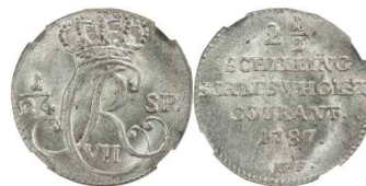
783. SCHLESWIG-HOLSTEIN: Christian VII , 1784-1808, BI 2 1/2 schilling, 1787, KM-124, Lange-142, initials MF, superb luster, well struck, NGC graded MS65 $200 - 400