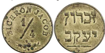
694. OTTOMAN PALESTINE: Zichron Jacob, after 1885, brass ¼ piastre (2.20g), Haffner-CC.17C, 21mm, name in English on one side, in Hebrew on the other side, choice EF $400 - 500