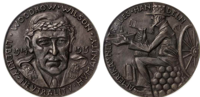
788. GERMANY: AE medal, 1915, Kienast-149, 56mm, American Neutrality by Karl Goetz: Facing bust of President Woodrow Wilson // AMERIKA'S NEUTRALES HANDELN, Abraham Lincoln seated on a pile of cannonballs, holding a ship in one hand, a bag of money in the other hand, cannon in the background, superb example, NGC graded MS65 BR $250 - 350