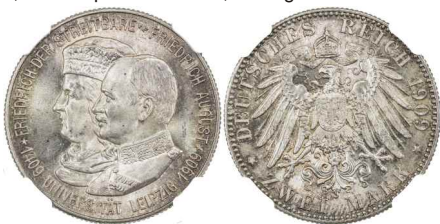
777. SAXONY: Friedrich August III , 1904-1918, AR 2 mark, 1909, Y-198, 500th Anniversary - Leipzig University, Crown Prince Friedrich the Pugnacious and Friedrich August III, NGC graded MS65 $120 - 160