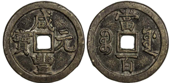
534. QING: Xian Feng , 1851-1861, AE 100 cash, Board of Works mint, Peking, H-22.762, 50mm, New branch mint, cast March 1854 to July 1855, brass ( huáng tóng ) color, VF $100 - 150