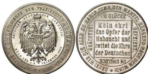
787. GERMANY: silvered medal, 1900, Weiler-3211, satirical medal for the visit to Cologne (Köln) of the president of South Africa, Paul Krüger, city shield on double-headed eagle, text on reverse, lustrous UNC $75 - 100