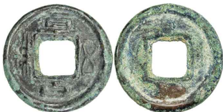
511. SHU: Anonymous , 221-265, AE cash (8.08g), H-11.1, zhi bai wu zhu in archaic script, F-VF $75 - 100

Shi Siming (Shun Tian) was a general of the Tang Dynasty who followed his childhood friend An Lushan in rebelling against Tang, and who later succeeded An Lushan's son An Qingxu as emperor of the Yan state that An Lushan had established. He was killed by his own troops in the spring of 761.