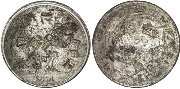
585. CHINESE CHOPMARKS: UNITED STATES: AR trade dollar, 1874-CC, dozens of chopmarks, scattered all around both sides, decent VF $100 - 150