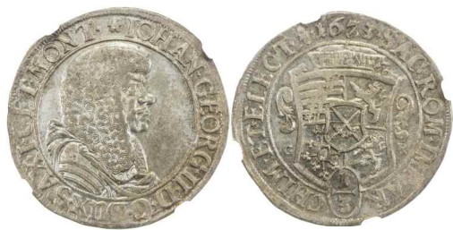
774. SAXONY: Johann Georg II , 1656-1680, AR 1/3 thaler, 1673, KM-547, initials CR, attractive light toning, NGC graded MS62 $300 - 400