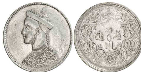
606. TIBET: AR rupee , [Chengdu], ND (1910-16 & 1930-33), Y-3.2, small bust with collar, vertical rosette, lightly cleaned, EF $75 - 100

Szechuan-Tibet trade issue. With portrait of the Chinese emperor Guang Xu derived from British Indian rupee of Queen Victoria.