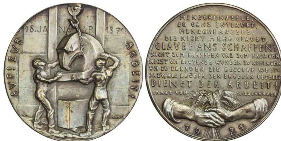
792. GERMANY: Weimar Republic, AR medal, 1921, Kienast-289, 36mm silver medal by Karl Goetz, Golden Jubilee celebration of the German Reich and the call for reconstruction after the Great War, two workers lift an eagle's head onto a pedestal with a crane // intertwined hands with stems of grain below inscriptions; on edge BAYER. HAUPTMÜNZAMT. FEINSILBER, nicely toned, EF $75 - 100