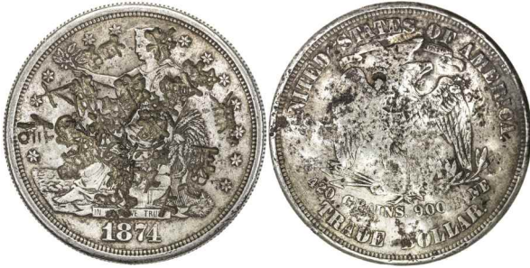
586. CHINESE CHOPMARKS: UNITED STATES: AR trade dollar, 1874-S, dozens of chopmarks, scattered all around both sides, decent VF $100 - 150