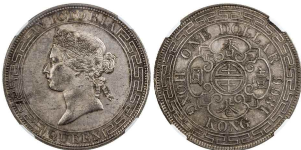
599. HONG KONG: Victoria , 1841-1901, AR dollar, 1866, KM-10, NGC graded MS62 $4,000 - 5,000