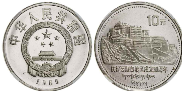
583. CHINA (PEOPLE'S REPUBLIC): AR 10 yuan, 1985, KM-127, Potala Palace, 20th anniversary of Tibetan autonomy, legends in both Chinese & Tibetan, mintage of 3,000 only, NGC graded PF68 UC $600 - 700