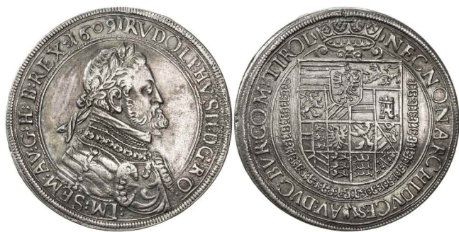
718. AUSTRIA: Rudolf II , 1576-1612, AR thaler, Hall, 1609, KM-381, Dav-3006, lightly tooled fields softened by old cleaning, possible faint mount repair, VF $150 - 200