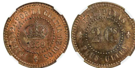
699. PHILIPPINES: Isabel II, 1833-1868, AE pattern 2 centavos (9.07g), 1859, KM-Pn12, NGC graded MS63 RB $300 - 400