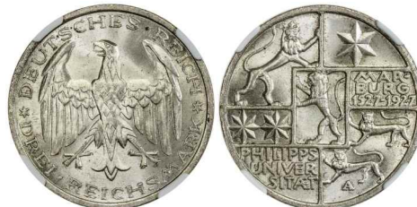
791. GERMANY: Weimar Republic, AR 3 mark, 1927-A, KM-53, 400th Anniversary - Philipps University in Marburg, NGC graded MS66 $175 - 250