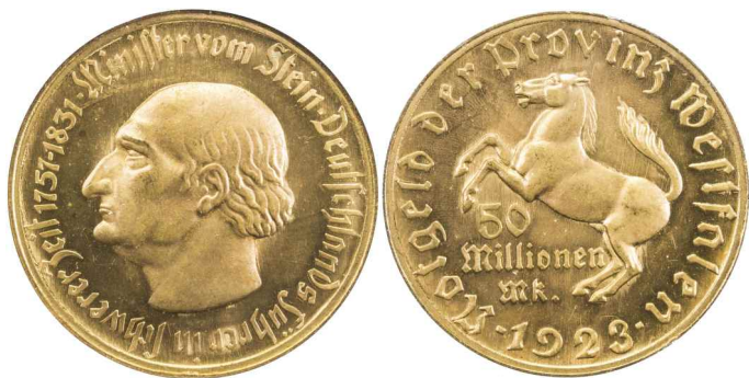
785. WESTPHALIA: AE 50 million mark, 1923, Menzel-26666.30, Lamb-579.11, Jaeger-N23a, gilt bronze issue, fantastic full luster, semi-prooflike, NGC graded MS65 $125 - 175