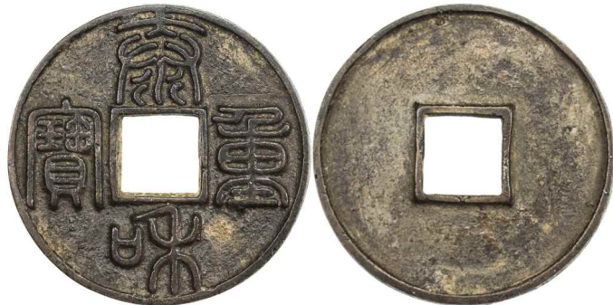
513. JIN: Tai He , 1204-1209, AE 10 cash (23.49g), H-18.63, seal script, fine casting style as usual, EF $400 - 500