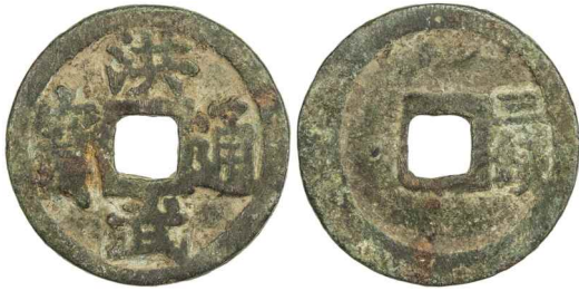
524. MING: Hong Wu , 1368-1398, AE 3 cash (10.14g), H-20.87, san qian at right on reverse, Fine $75 - 100