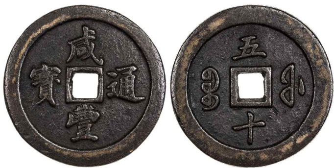
537. QING: Xian Feng , 1851-1861, AE 50 cash, Fuzhou, Fujian Province, H-22.782, 57mm, one dot tong, copper ( tóng ) color, cast 1853-55, a lovely example! VF $400 - 500