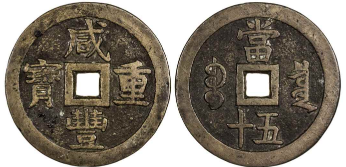
530. QING: Xian Feng , 1851-1861, AE 50 cash, Board of Revenue mint, Peking, H-22.704, 56mm, North branch mint, brass ( huáng tóng ) color, cast June 1853 to February 1854, VF $100 - 150