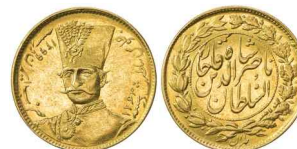
648. IRAN: Nasir al-Din Shah , 1848-1896, AV toman (2.94g), Tehran, AH1299, KM-933, AU $200 - 250