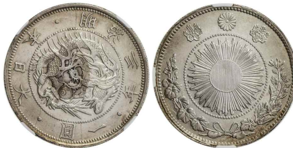
665. JAPAN: Meiji , 1867-1912, AR yen, year 3, Y-5.1, "repaired" (appears to be just the removal of one spot of adhesion, noticeable only when shifted under bright light), NGC graded UNC details $150 - 200