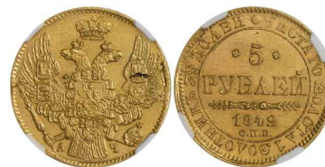
870. RUSSIAN EMPIRE: Nicholas I, 1825-1855, AV 5 roubles, 1842, Cr-175.1, СПБ mint, mintmaster АЧ, NGC graded MS61 $600 - 700