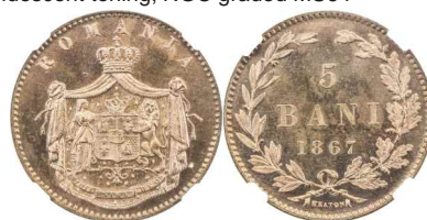
863. ROMANIA: Carol I, Prince, 1866-1881, AE 5 bani, 1867, KM-3, Heaton Mint, Birmingham specimen strike, NGC graded MS65 RD $100 - 150

Although listed as MS (Mint State) on the NGC holder, this should more appropriately be labeled as SP (Specimen).