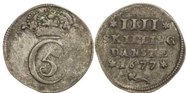
857. NORWAY: Christian V, 1670-1699, BI 4 skilling (4.69g), 1677, KM-136, NM-126, VF $150 - 200

Please visit our website for images of the mica inserts.