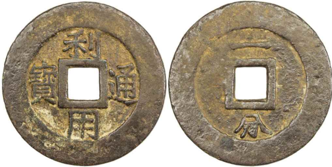
526. NAN MING: Li Yong , 1674-1678, AE 10 cash (15.52g), H-21.102, yi fen on reverse, VF $75 - 100