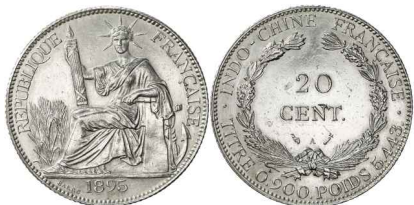
632. FRENCH INDOCHINA: AR 20 cents, 1895-A, KM-3, Lec-194, reverse legend variety, TITRE 0.900. POIDS 5.443, cleaned EF, S $100 - 150