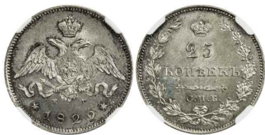
867. RUSSIAN EMPIRE: Nikolas I, 1825-1855, AR 25 kopek (4.98g), 1829, Cr-159, Bitkin-128, СПБmint, mintmaster НГ, a fantastic example! NGC graded MS66 $7,000 - 8,000