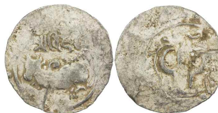
617. CANDRA: Dharmavijaya, ca. 644-680, AR unit (7.73g), Mitch-LW.46, Mahlo-41, recumbent humped bull left // axial pole in temple (aka Srivatsa), sun & moon above, garland around, usual weakness of strike, EF, RR $250 - 300

Thick narrow silver coins of this style differ from the standard 64 ratti & 16 ratti pieces, and were likely the product of a different mint for local circulation.