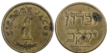
696. OTTOMAN PALESTINE: Zichron Jacob, after 1885, brass 1 piastre (5.10g), Haffner-CC.17A, 27mm, name in English on one side, in Hebrew on the other side, two spots on reverse, EF $500 - 600

These tokens were struck in Paris in 1885, for use as small change in this settlement, and also used as small change in Jaffa, Haifa and in the nearby Arab settlements due to the lack of Ottoman copper coins.