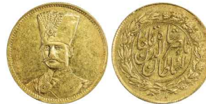
647. IRAN: Nasir al-Din Shah , 1848-1896, AV toman (2.86g), Tehran, ND, KM-932, choice EF $200 - 250