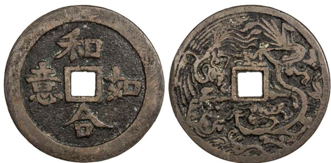
555. QING: AE charm (41.69g), CCH-968, 55mm, he he ru yi (May you have a harmonious union with all your wishes fulfilled) // dragon & phoenix, F-VF $75 - 100

Possibly cast in late Qing or early Min Guo era. Photo size reduced.