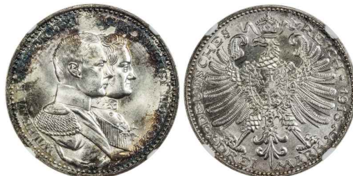
781. SAXE-WEIMAR-EISENACH: AR 3 mark , 1915-A, KM-222, 100th Anniversary of the Grand Duchy of Saxe-Weimar-Eisenach, a superb example! NGC graded MS66 $200 - 300