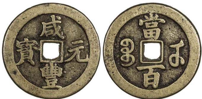
538. QING: Xian Feng , 1851-1861, AE 100 cash, Wuchang mint, Hubei Province, H-22.861, 57mm, brass ( huáng tóng ) color, cast 1854-56, poor casting style as usual, VF $100 - 150