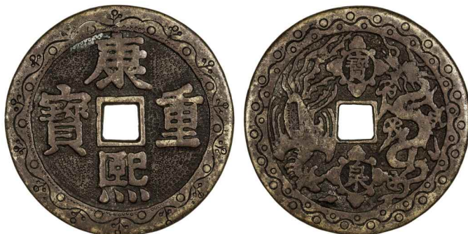
560. QING: AE charm, 56mm, kang xi tong bao // phoenix and dragon, bao qun above and below with ornate ornamentation around the rims and within fields, Fine, ex Stephen Album Rare Coins Auction 24, Lot 1167 $200 - 300

Likely a later casting made in the Min Guo (Republican) era. Photo size reduced.