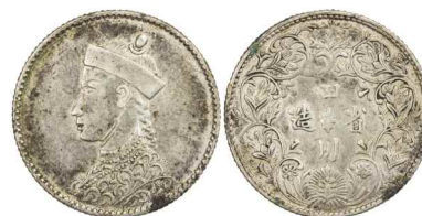
605. TIBET: AR ½ rupee , ND [1904-12], Y-2, Kann-595, L&M-361, lovely bold strike, AU $500 - 700

Szechuan-Tibet trade issue. With portrait of the Chinese emperor Guang Xu derived from British Indian rupee of Queen Victoria.