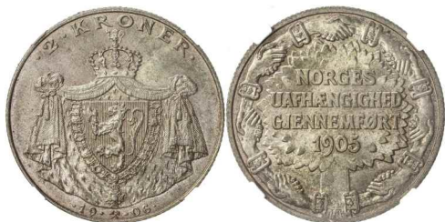
858. NORWAY: Haakon VII, 1905-1957, AR 2 kroner, 1906, KM-363, Independence Commemorative, lush violet toning, NGC graded MS65 $250 - 350