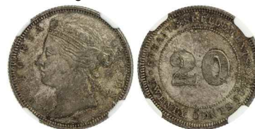
703. STRAITS SETTLEMENTS: Victoria, 1837-1901, AR 20 cents, 1873, KM-12, an unheard of mint state example of this very rare date, NGC graded MS64, RR $1,200 - 1,500

The only example in mint state graded at NGC as of July 2017. The next highest graded example is AU58.