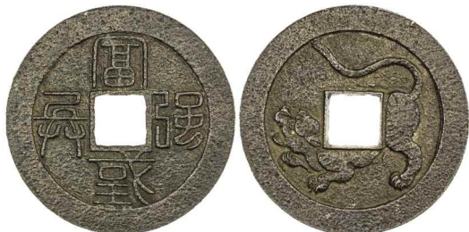
663. JAPAN: Keio , 1865-1868, AE 50 mon (9.66g), Hosogaya mint at Mito, Hitachi Province, ND (1867), H-7.4, type known as a Mito Tora-sen (Mito Tiger Coin), cast in bronze, a lovely example! Choice EF, R $400 - 500

Legend in seal script translates as "Enrich the Country and Strengthen the Military." Cast at the Hosogaya Mito / Hitachi (today Ibaraki-ken). The original cast in 1864 in iron was a local emergency coin used to pay the workmen at the financially troubled copper coin mint in Mito. In 1867 copper-alloy was cast supposedly from bronze cannon which the daimyo (local feudal lord) had made out of temple bells.