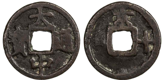
523. MING: Da Zhong , 1361-1368, AE 10 cash (19.78g), Nanking mint, H-20.47, 44mm, jing above, shi (ten) at right on reverse, decent Fine $75 - 100