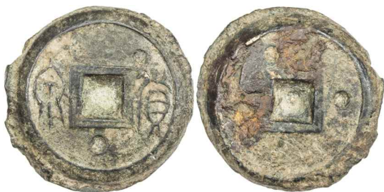
509. XIN: Wang Mang , AD 7-23, AE cash (36.71g), H-9.60, 34.42mm large size and heavy bing (biscuit) huo quan , a lovely example! VF $75 - 100