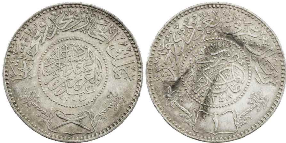
641. HEJAZ & NEJD: 'Abd al-'Aziz b. Sa'ud , 1926-1953, AR riyal, Makka al-Mukarrama (Mecca), AH1348, KM-12, rare date, VF-EF, S $150 - 250