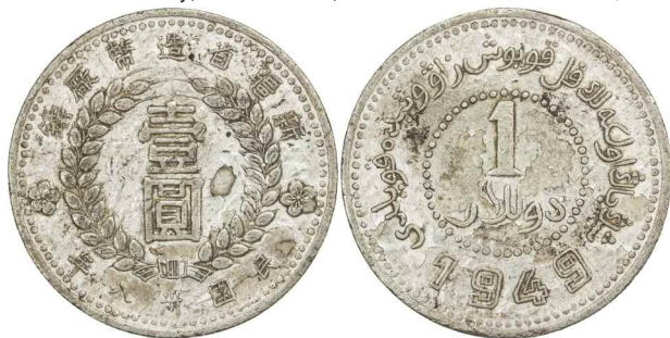
577. SINKIANG: Republic, AR dollar, 1949, as Y-46.2, as L&M-842, pointed base 1 variety, very interesting contemporary fourrée with plating flaking off, VF $75 - 100