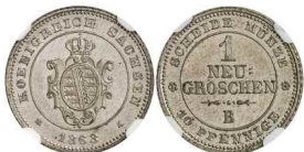
775. SAXONY: Johann , 1854-1873, AR neu-groschen, 1863-B, KM-1219, gorgeous example, NGC graded MS66, RR $200 - 250