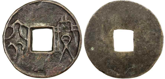
501. WARRING STATES: State of Qi , 300-200 BC, AE cash (8.11g), H-6.25, yi liu hua ([City of] Yi, [value] six hua) in archaic script, pleasing F-VF $100 - 150