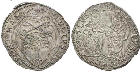
837. ROMAN STATES: Julius II , 1503-1513, AR giulio (3.61g), ND, Berman-574, CNI-102, Muntoni-32, Rome mint, crossed keys and tiara above coat of arms within an elongated quadrilobe with .IVLIVS.II. PONTI MAX. // St. Peter holding Gospel and key to left with St. Paul holding Gospel and sword to right with S.PETRVS. S.PAVLVS. around and .ROMA. in exergue, pleasing light tone, Choice EF, R $180 - 220