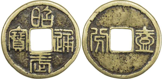
527. NAN MING: Zhao Wu , 1678, AE 10 cash (9.76g), H-21.111, seal script, yi fen on reverse, F-VF $75 - 100