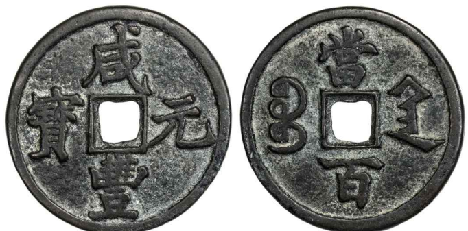
540. QING: Xian Feng , 1851-1861, AE 100 cash (68.42g), Xi'an, in Shaanxi Province, H-22.950, 58mm, large size coin with six stroke bei , cast in 1854, VF $75 - 100