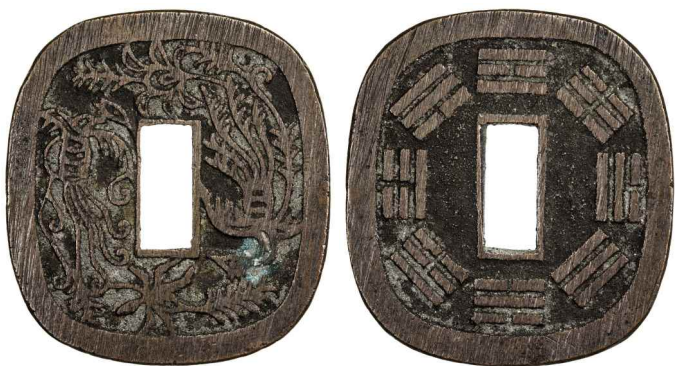
661. JAPAN: Bunkyu , 1861-1864, AE 100 mon (48.75g), Akita mint, Ugo Province, ND (1862), KM-6.1, 48mm x 52mm, short-tailed phoenix // trigrams, VF $100 - 140