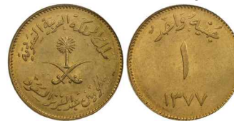
701. SAUDI ARABIA: Sa'ud b. 'Abd al-'Aziz, 1953-1964, AV guinea, AH1377, KM-42, AGW 0.2354 oz, NGC graded MS63 $300 - 350