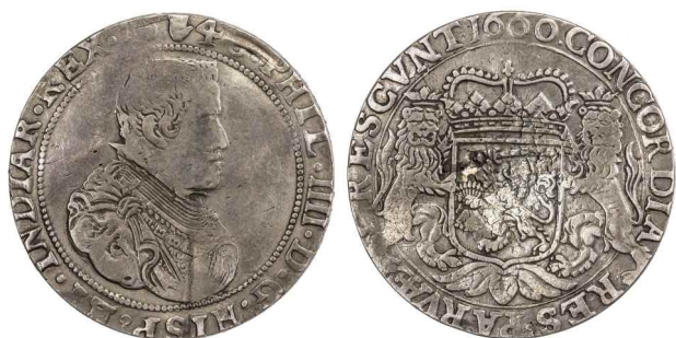
856. NETHERLANDS: box taler with 5 mica inserts of young musicians, obverse fashioned from a 1660 Antwerp ducatone (D-4454), reverse from Dutch rider thaler (D-4947), VF, RR $240 - 280

The mica is well preserved, some degeneration as normal; also small old piercing on the reverse; still attractive and very rare.