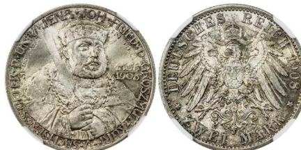
780. SAXE-WEIMAR-EISENACH: AR 2 mark , 1908, Y-174, 350th Anniversary of the Jena University, a lovely example! NGC graded MS66 $200 - 250