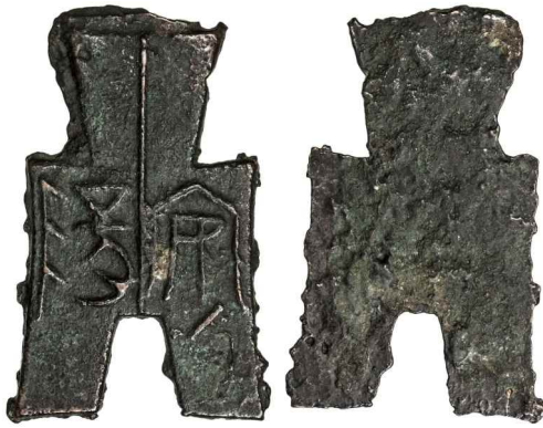
496. WARRING STATES: State of Yan , 350-250 BC, AE spade money (14.49g), H-3.184, flat handle square foot spade type, an yang in archaic script, large size flan, VF $100 - 150