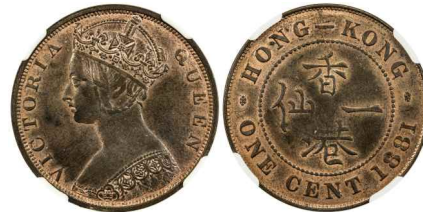
593. HONG KONG: Victoria, 1841-1901, AR cent, 1881, KM-4.3, NGC graded MS62 BR $150 - 200