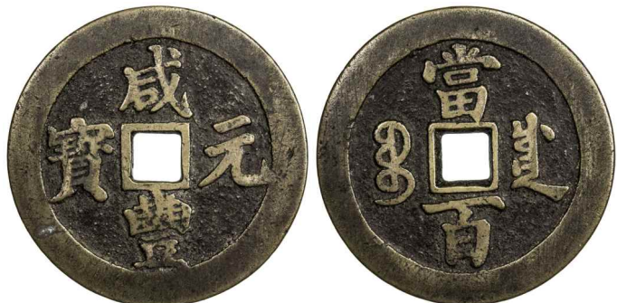
543. QING: Xian Feng , 1851-1861, AE 100 cash, Chengdu mint, Sichuan Province, H-22.981, 55mm, brass ( huáng tóng ) color, cast 1853-55, VF $75 - 100