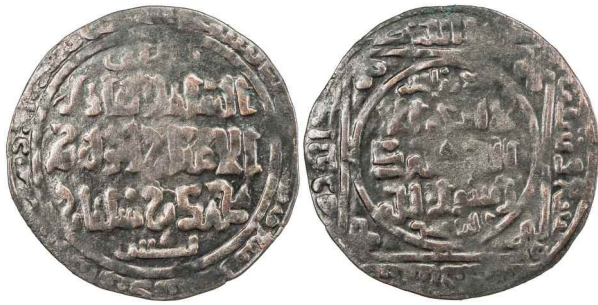
382. KHWARIZMSHAH: Muhammad , 1200-1220, AE broad dirham (6.09g), Samarqand, AH609, A-1722, very rare date for this mint, clear date both sides, VF, RR $120 - 160