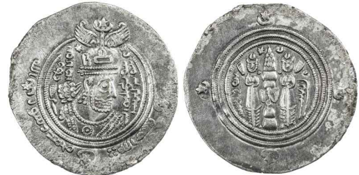
65. ARAB-SASANIAN: 'Abd al-Malik b. 'Abd Allah , 685-686, AR drachm (3.85g), BYSh (Bishapur), AH67, A-20, the earlier silver Islamic coin type to include the phrase muhammad rasul Allah , in the third quadrant of the obverse margin, few corrosion spots around at the edge, VF, RR $150 - 200

The date is somewhat coarsely engraved, but clearly DWShST for 62. 'Abd Allah was at war with the Hunnic tribes during the 60s, and this was likely issued quasi-officially by the Huns or their allies.