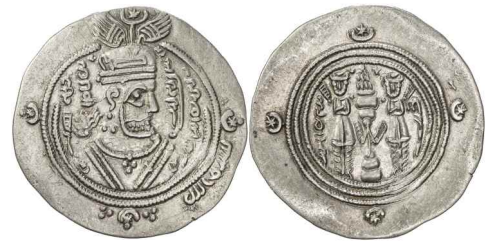
63. ARAB-SASANIAN: 'Ubayd Allah b. Ziyad , 673-683, AR drachm (4.05g), DA (Darabjird), YE51, A-12, lightly cleaned, pleasing strike, bold VF $100 - 150

The Pahlavi script often used the letter L to represent either L or R, with a few exceptions, such as the mint of Ardashir Khurra, which was signed ART rather than ALT, but most of the time, what is pronounced R is written with L.