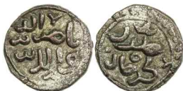
387. QARLUGHID: Nasir al-Din Muhammad , 1249-1259 AH, AE jital (3.53g), Kurraman, ND, A-1818K, nasir al-dunya / wa'l-din // darb / kurraman , newly discovered type, with some original silver-wash, lovely EF-AU $100 - 140