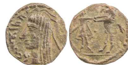
45. KESH: Unknown ruler , 7th-8th century, AE cash (2.18g), Rtveladze-39, bust left, elaborate hair style with long locks, Sogdian legend before face // single combat scene, king with short sword killing lion that is standing on its hind legs, VF $150 - 250