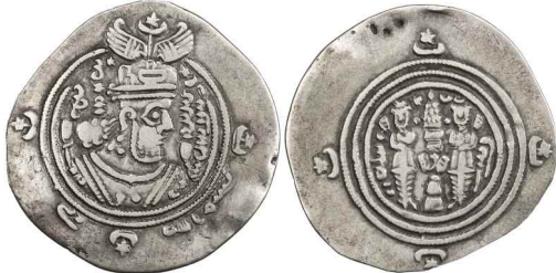
60. ARAB-SASANIAN: Ziyad b. Abi Sufyan , 665-673, AR drachm (3.62g), BYSh (Bishapur), AH54, A-8, very rare date for a common mint, couple minor nicks, VF, RR $160 - 200