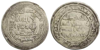
109. UMAYYAD: al-Walid I , 705-715, AR dirham (2.72g), Sijistan, AH96, A-128, Klat-438, VF $100 - 140

Abarshahr was an alternative name for the city of Nishapur in Khorasan Province.