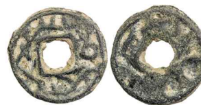
47. SAMARKAND: Turgar , ca. 700-710, AE cash (2.38g), Smirnova-519, tamghas of Samarkand & the Ikshids, crescent above, square hole, Fine $100 - 150