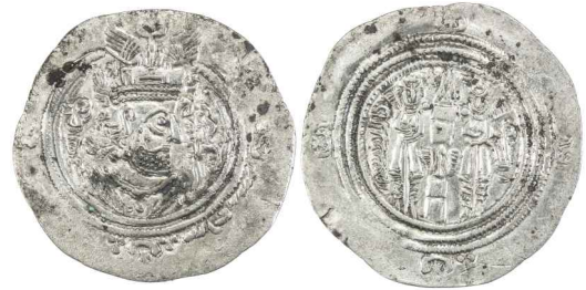
64. ARAB-SASANIAN: 'Abd Allah b. Khazim , 682-692, AR drachm (3.03g), MRW (Marw), AH62, A-19, contemporary imitation, two pellets at 5:30 in reverse margin, lightly cleaned, VF, RR $150 - 200

The date is somewhat coarsely engraved, but clearly DWShST for 62. 'Abd Allah was at war with the Hunnic tribes during the 60s, and this was likely issued quasi-officially by the Huns or their allies.