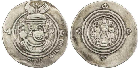
59. ARAB-SASANIAN: Ziyad b. Abi Sufyan , 665-673, AR drachm (3.80g), DA (Darabjird), YE43 (frozen), A-8, actually struck circa AH50-52, interesting graffiti in the reverse margin, VF $100 - 140