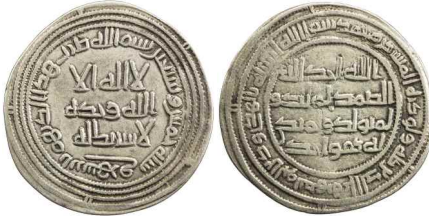
108. UMAYYAD: al-Walid I , 705-715, AR dirham (2.75g), Abarshahr, AH95, A-128, Klat-9a, the word al-mashrikun without the letter "waw", VF $120 - 160

Abarshahr was an alternative name for the city of Nishapur in Khorasan Province.