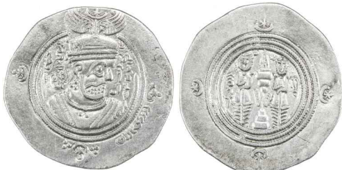
61. ARAB-SASANIAN: Samura b. Jundab , ca. 672-673, AR drachm (3.86g), DA (Darabjird), AH43 (frozen), A-9, Arabic graffiti in reverse margin, lightly cleaned, VF, R $200 - 250