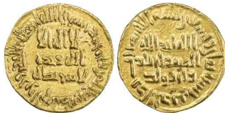
110. UMAYYAD: Sulayman , 715-717, AV dinar (4.27g), NM (Dimashq), AH98, A-130, choice EF $450 - 550