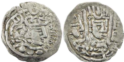
41. BUKHAR KHODAT: Anonymous , ca. 700-750, AR "mug" drachm (3.09g), [Samarqand], cf. Z-172243, Sasanian style, derived from the standard drachm of Varahran V, without any countermark, minted in the Samarqand region, VF-EF $100 - 140