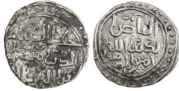
383. KHWARIZMSHAH: Mangubarni , 1220-1231, AR dirham (3.13g), NM [Ghazna], ND, A-1745.1, ruler's name and title jalah al-dunya wa'l-din // the caliph's name, al-nasir li-din Allah , choice VF, RR $500 - 600

The dies were engraved by the same staff that produced his father's equivalent (A-1721) and the issue in the name of Chingiz Khan (A-1967), and it is much rarer that either of those two. It must have been struck very briefly, perhaps just after the Mongol troops left Ghazna en route to the Indus River, chasing Mangubarni's father, 'Ala al-Din, before the Mongols returned to the region. It may have been struck outside of Ghazna in the same general area.