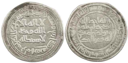
105. UMAYYAD: al-Walid I , 705-715, AR dirham (2.53g), Ramhurmuz, AH94, A-128, Klat-387, modest porosity, scarce date, VF $100 - 140