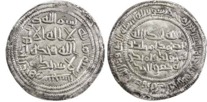
112. UMAYYAD: 'Umar , 717-720, AR dirham (2.44g), Sijistan, AH100, A-133, Klat-442a, VF $600 - 800