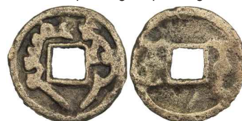
44. IKSHID: Gurak , ca. 710-738, AE cash (2.82g), Smirnova-359ff, name of ruler in Sogdian / two tamgas of Samarqand, pleasing F-VF $140 - 180