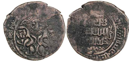
388. ARTUQIDS OF MARDIN: al-Salih Salih , 1312-1364, AE double fals (6.12g) (Mardin), AHxx7, A-1840, SS-53, Zeno-183587 (this piece), two lions, back-to-back, some weakness as always for this type, VF, RR $150 - 200