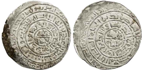
385. GHORID: Mu'izz al-Din Muhammad , 1171-1206, AR dirham (3.19g), NM, ND, A-1770, "bull's eye" type, with Qur'an 9:33 repeated in both obverse & reverse margin, hence without mint & date, choice EF, R $100 - 150