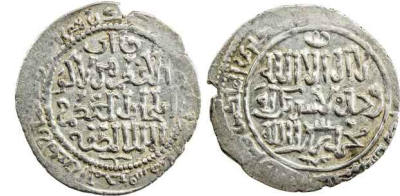
390. ARTUQIDS OF MARDIN: Qara Arslan , 1261-1294, AR dirham (2.80g), Mardin, DM, A-1837A, Zeno-183586 (this piece), citing the Ilkhan Hulagu as overlord, with the Artuqid ruler cited only by his laqab al-Muzaffar, month of Muharram, EF, RR $150 - 250