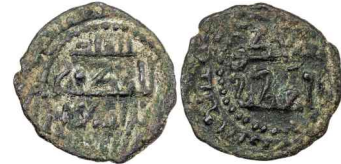
389. ARTUQIDS OF MARDIN: Qara Arslan , 1261-1294, AE fals (2.73g), NM, ND, A-1836.1, also citing the Ilkhan overlord Hulagu, very rare issue of this ruler, F-VF, RR $100 - 150