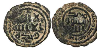
127. UMAYYAD: AE fals (2.44g), Darabjird, AH102, A-199, anonymous, unpublished date for this mint, some weakness near the rim, fully clear date, F-VF, RRR $300 - 400

Only the years 104, 117 and 119 have previously been reported for copper fulus of this mint.