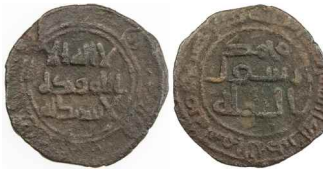
130. UMAYYAD: AE fals (2.05g), al-Mansura, AH119, A-A204, very rare mint in Sind, known dated 116, 119, and 121, F-VF, RR $100 - 150