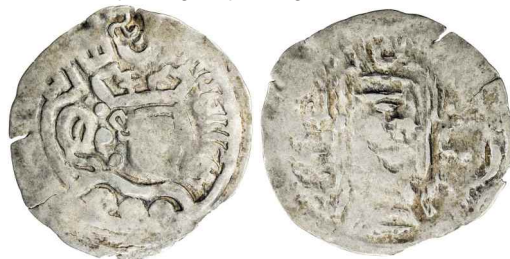
43. BUKHAR KHODAT: Anonymous , ca. 700-750, AR "mug" drachm (3.10g), NM, cf. Z-172243, Sasanian style, derived from the standard drachm of Varahran V, with triskeles countermark, minted in the Samarqand region, pleasing VF $100 - 140