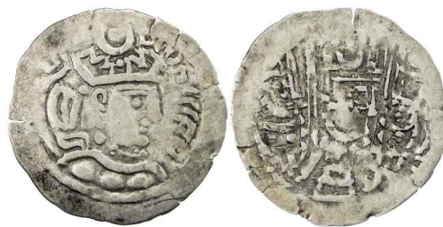
42. BUKHAR KHODAT: Anonymous , ca. 700-750, AR "mug" drachm (3.17g), NM, cf. Z-172243, Sasanian style, derived from the standard drachm of Varahran V, without any countermark, minted in the Samarqand region, pleasing VF $100 - 140