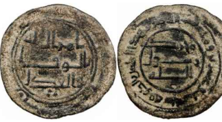
129. UMAYYAD: AE fals (3.06g), al-Kufa, AH126, A-203, W-P.143, anonymous, well strike, with legends fully legible, VF, RR $150 - 200