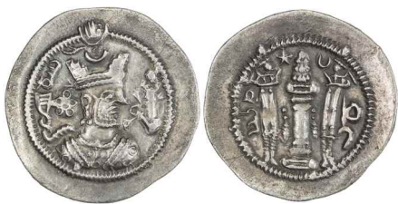
36. SASANIAN KINGDOM: Zamasp , 497-499, AR drachm (3.84g), MY (Mishan), year 2, G-181, king offered a diadem by his son, lovely bold strike, VF-EF $150 - 200