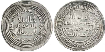
106. UMAYYAD: al-Walid I , 705-715, AR dirham (2.90g), Arminiya, AH95, A-128, Klat-49, wonderful bold strike, EF-AU $200 - 240