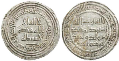
107. UMAYYAD: al-Walid I , 705-715, AR dirham (2.41g), Sarakhs, AH95, A-128, Klat-455b, clipped to a later standard, choice VF $130 - 170