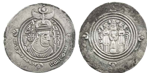
67. ARAB-SASANIAN: Khalid b. 'Abd Allah , ca. 692-694, AR drachm (4.04g), BYSh (Bishapur), AH73, A-24, with the phrase muhammad rasul Allah in the obverse margin, "3" of date in Pahlavi numeral rather than word, some light hornsilver only in reverse margin, EF, R $150 - 200