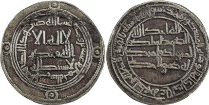
120. UMAYYAD: Marwan II , 744-750, AR dirham (2.80g), Balkh, AH128, A-142, Klat-186, VF, S $150 - 200