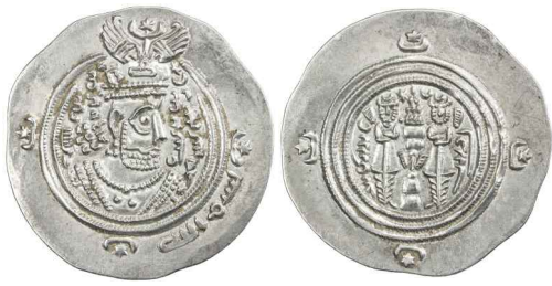
58. ARAB-SASANIAN: 'Abd Allah b. 'Amir , ca. 661-664, AR drachm (4.02g), BYSh (Bishapur), AH44, A-7, bold strike, EF $150 - 200