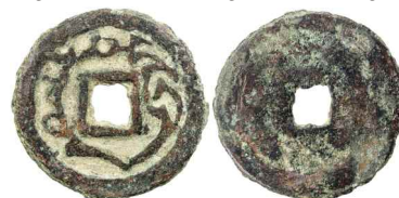
46. SAMARKAND: Tarkhun , ca. 700-710, AE cash (3.24g), Smirnova-215, tamghas of Samarkand & the Ikshids, square hole, Fine $100 - 150