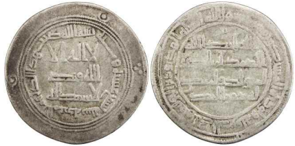
119. UMAYYAD: Hisham , 724-743, AR dirham (2.69g), al-Mubarakah (= Balkh), AH119, A-137, Klat-577b, F-VF $100 - 120