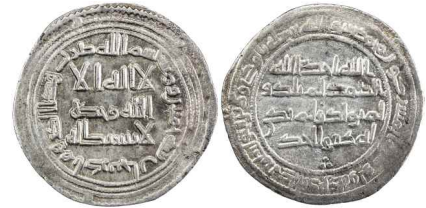
114. UMAYYAD: Yazid II , 720-724, AR dirham (2.81g), Adharbayjan, AH105, A-135, Klat-24a.1, triplet of pellets below reverse field, lightly cleaned, VF $150 - 200