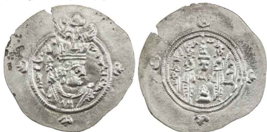
38. SASANIAN KINGDOM: Yazdigerd III , 632-651, AR drachm (3.96g), SK (Sijistan), year 5, G-234, bold strike, some discoloration mainly in margins, with some very light adhesions near rim, EF, R $120 - 140