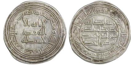
113. UMAYYAD: 'Umar , 717-720, AR dirham (2.88g), Kirman, AH101, A-133, Klat-532, nearly EF $100 - 120