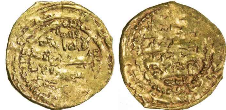
391. ZANGIDS OF AL-MAWSIL: Mahmud , 1219-1233, AV dinar (5.04g), al-Mawsil, AH6xx, A-1869, Jafar-16, also citing the Ayyubids al-Kamil & al-Ashraf, the caliph al-Nasir, and the heir to the caliphate 'Uddat al-Din Abu Nasr Muhammad, known only for the years AH620 & 621, much weakness, crude VF $200 - 300