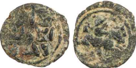
122. UMAYYAD: AE fals (1.43g), NM, ND, A-155, W-587, first half of kalima // helmeted horsement right, star upper left, pellet upper right, VF, RR $150 - 200