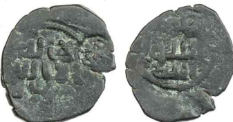
124. UMAYYAD: AE fals (4.19g), NM, ND, A-C192, countermarked undeciphered Byzantine monogram (probably royal) on Umayyad type A-153, VF countermark on Fine host, RR $120 - 160