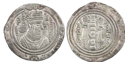
66. ARAB-SASANIAN: 'Umar b. 'Ubayd Allah , 686-691, AR drachm (2.56g), ART (Ardashir Khurra), AH70, A-21, clipped down to later standard, VF $100 - 140