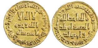
115. UMAYYAD: Hisham , 724-743, AV dinar (4.24g), NM (Dimashq), AH115, A-136, bold strike, EF-AU $550 - 650