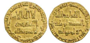
116. UMAYYAD: Hisham , 724-743, AV dinar (3.64g), NM (Dimashq), AH114, A-136, clipped down, VF $220 - 260