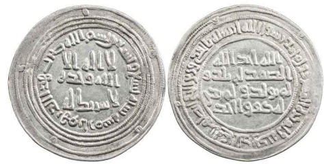
111. UMAYYAD: Sulayman , 715-717, AR dirham (2.87g), Arminiya, AH99, A-131, Klat-53, choice EF $200 - 300