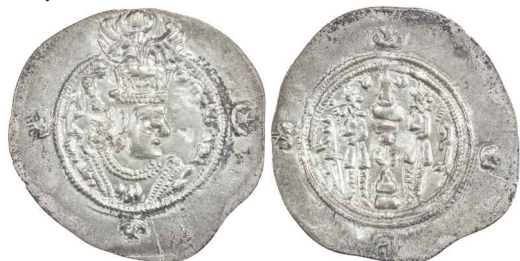
37. SASANIAN KINGDOM: Yazdigerd III , 632-651, AR drachm (4.00g), SK (Sijistan), year 4, G-234, nice strike, EF-AU $180 - 220