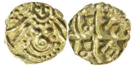
384. GHORID: Mu'izz al-Din Muhammad , 1171-1206, AV dinar (4.25g), ND, A-1764.2, De-253, Bayana mint type, with Nagari legend sri maha- / mira mahama- / da samah , stylized image of Lakshmi seated on obverse, EF-AU $250 - 300

The dies were engraved by the same staff that produced his father's equivalent (A-1721) and the issue in the name of Chingiz Khan (A-1967), and it is much rarer that either of those two. It must have been struck very briefly, perhaps just after the Mongol troops left Ghazna en route to the Indus River, chasing Mangubarni's father, 'Ala al-Din, before the Mongols returned to the region. It may have been struck outside of Ghazna in the same general area.