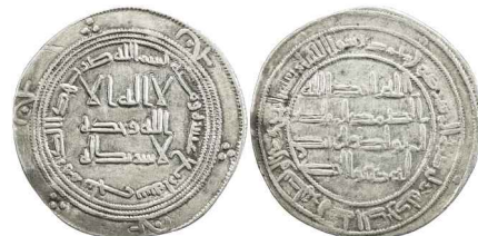
117. UMAYYAD: Hisham , 724-743, AR dirham (2.86g), Balkh, AH114, A-137, Klat-179, with the word bakh ("good") repeated 3 times in the obverse margin, scarce date, attractive VF $150 - 200