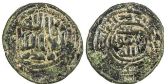
123. UMAYYAD: AE fals (3.92g), Manbij, ND (ca. 710s), A-183, W-Ox.4, overstruck on undetermined host, probably the earlier plain type (A-153 or similar), VF, R $120 - 160