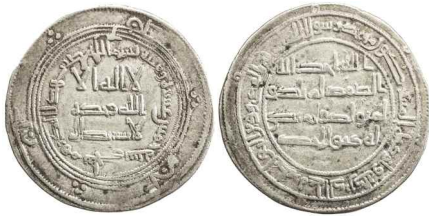
118. UMAYYAD: Hisham , 724-743, AR dirham (2.76g), Balkh, AH115, A-137, Klat-180, with the word bakh ("good") repeated 3 times in the obverse margin, pleasing VF $150 - 200