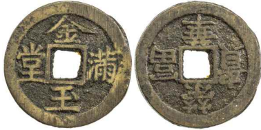
835. QING: AE charm (4.23g), CCH-1134, rong hua fu gui (high position and great wealth) // jin yu man tang (may gold and jade fill your house [halls]), VF, ex Daniel K. Ching Collection $75 - 100