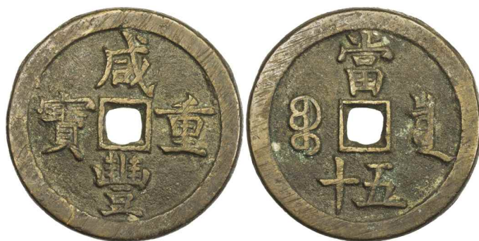
782. QING: Xian Feng , 1851-1861, AE 50 cash, Board of Revenue mint, Peking, H-22.705, 46mm, East branch mint, cast 1854-1855, VF $75 - 100