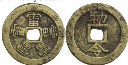
824. QING: AE charm (4.23g), "wu lei" charm, lei repeated five times around obverse // two characters on reverse, VF , ex Daniel K. Ching Collection $75 - 100