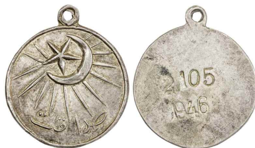
910. SINKIANG: Second East Turkestan Republic , 1944-1949, AR medal (10.59g), 1946, 32mm, with original loop, shining star & crescent, sadaqat ("loyalty") below in Uygur script // punched date & award number (#2105), EF-AU, RR $300 - 400

The East Turkestan Republics Orders and medals were all instituted in 1945, the same year as the III National Army was formed. They are little known and all extremely rare.