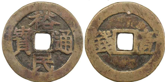
779. NAN MING: Yu Min , 1674-1676, AE 100 cash (16.75g), H-21.124, yi qian (one fen [of silver]) on reverse, Fine $75 - 100