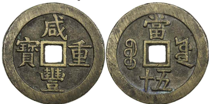
781. QING: Xian Feng , 1851-1861, AE 50 cash (64.25g), Board of Revenue, Peking, H-22.703, 57mm, South branch mint, cast 1853-54, brass ( huang tong ) color, with virtually no wear, EF $100 - 140

Palace cash were first introduced in 1752 for use by palace guards and eunuchs.