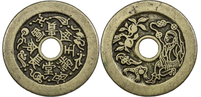
840. QING: AE charm (22.47g), CCH-1799, 45mm, jin yu man tang chang ming fu gui (enjoy long life and prosperity) // Liu Hai playing with toad, VF-EF $75 - 100

An interesting piece, strikingly different from charms normally found in China.