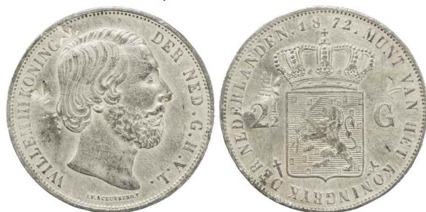
954. NETHERLANDS: William III , 1849-1890, AR 2½ gulden, 1872, KM-82, with three large Chinese chopmarks, AU, R $100 - 150

Netherlands coins are difficult to find chopmarked from China.