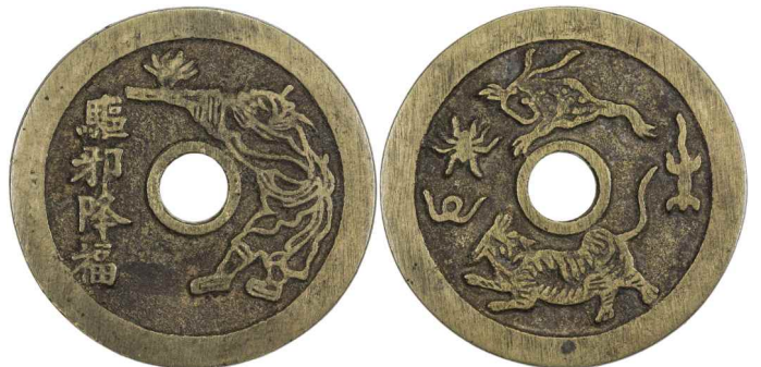
841. QING: AE charm (26.53g), CCH-1822, "Five Poisonous Creatures" charm, Liu Hai or Zhong Kui standing right, auspicious spider above, qu xie jiang fu (expel evil and send down good fortune) // the large animal at the right is a tiger or cat and to the right of its tail is a lizard and to the left is a spider, and a snake is at the left of the center hole and the three legged toad is at the lower left, EF $100 - 150