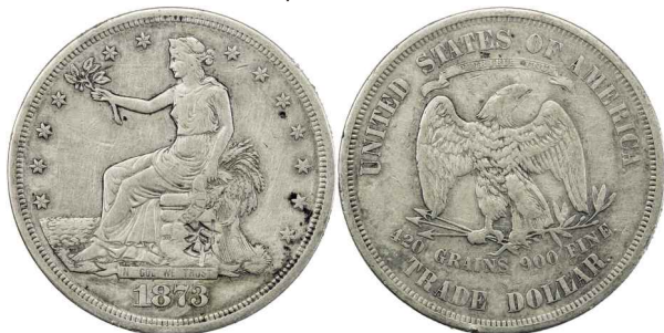
965. UNITED STATES: AR trade dollar, 1873-S, with one large Chinese chopmark, VF $100 - 150

United States half dollars are difficult to find chopmarked from China.