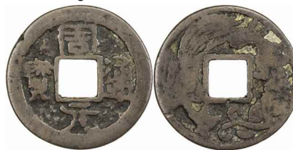
833. QING: AE charm (5.82g), CCH—, zhou yuan tong bao // dragon & phoenix, Fine , ex Daniel K. Ching Collection $75 - 100