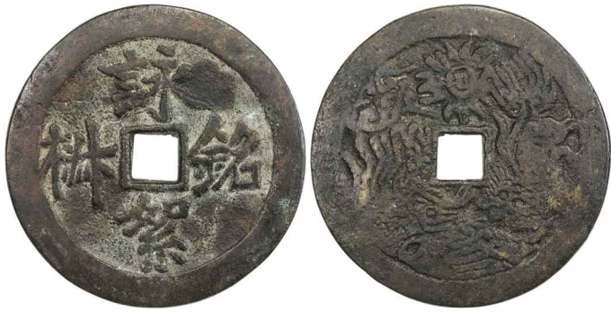
834. QING: AE charm, CCH-1001, 58mm, yong xu ming liu // dragon & phoenix, Fine, R $75 - 100

Likely cast during the Min Guo (Republican) period, 1920-30s.