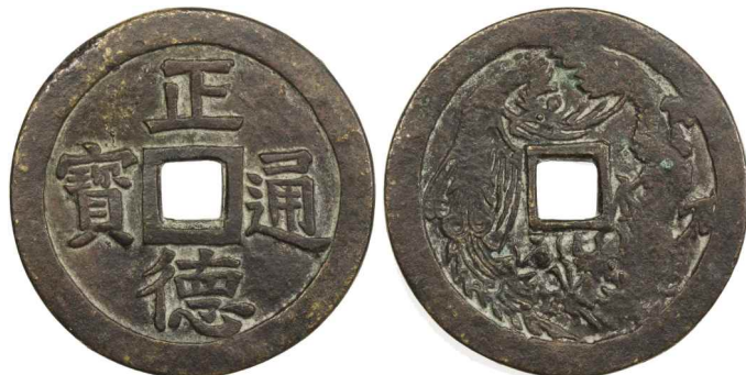
813. QING: AE charm , CCH-557 volume II, 61mm, zheng de tong bao // dragon & phoenix (rare reverse variety), Fine, R $75 - 100