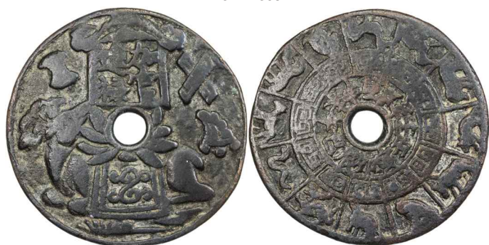
773. YUAN: AE charm , CCH-1003, S-73, 59mm, capped board with "A respectful official is promoted" with a monkey on the lower portion, sycee at upper left, below deer nibbling on the leaves of the felicitous herb of immortality / Rat, Ox, Tiger, Rabbit, Dragon, Snake, Horse, Sheep, Monkey, Rooster, Dog and Pig, the animals of the Chinese zodiac with zi chou yin mao chen si wu wei shen you xu hai around central hole, VF $150 - 200

Coins cast by the rebel Prince of Zhou, Wu Sangui, bear the inscription li yong (profitable use) instead of a reign title as Wu Sangui did not declare himself emperor until March 1678, when he took the nien hao (reign title) of Zhao Wu, but he died in October 1678 of dysentery, and no coins bearing the new title were cast.