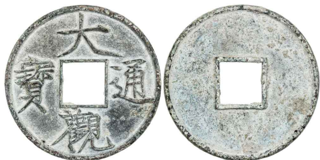
770. NORTHERN SONG: Da Guan , 1107-1110, AE 10 cash (17.84g), H-16.426, slender golden script, lovely patina, EF $75 - 100