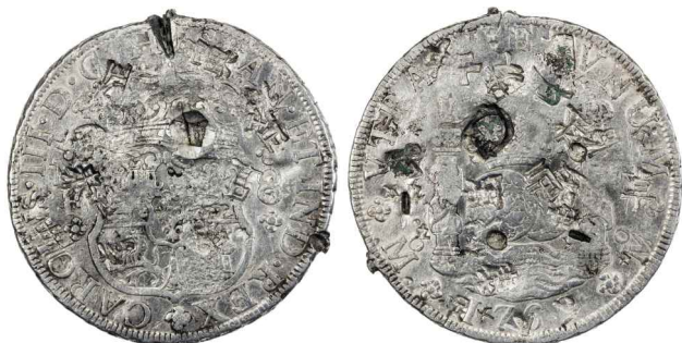
951. MEXICO: Carlos III , 1759-1788, AR 8 reales, 1769-Mo, KM-105, 'pillar dollar' or 'columnario' type, assayer MF, with test-cuts and numerous large and small Chinese chopmarks on both sides, AU $100 - 150