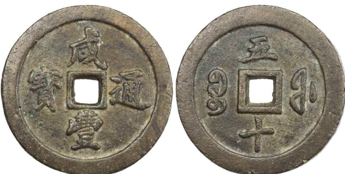
788. QING: Xian Feng , 1851-1861, AE 50 cash, Fuzhou mint, Fujian Province, H-22.782, 57mm, cast 1853-55, tóng (copper) color, VF $400 - 500