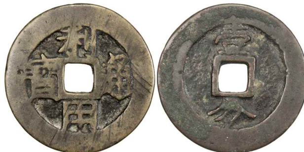
777. NAN MING: Li Yong , 1674-1678, AE 10 cash (16.38g), H-21.100, yi fen above and below on reverse, VG, S, ex Jiùjìnshan Collection $60 - 80

Coins cast by the rebel Prince of Zhou, Wu Sangui, bear the inscription li yong (profitable use) instead of a reign title as Wu Sangui did not declare himself emperor until March 1678, when he took the nien hao (reign title) of Zhao Wu, but he died in October 1678 of dysentery, and no coins bearing the new title were cast.