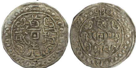
995. TIBET: Dao Guang , 1821-1850, AR sho (3.76g), year 2 (1822), Cr-93, L&M-64, EF $150 - 250