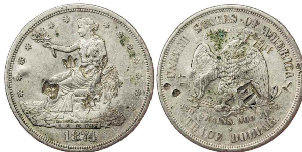
968. UNITED STATES: AR trade dollar, 1874-S, with many large Chinese chopmarks either side, EF $125 - 175