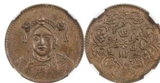
914. SZECHUAN-TIBET: Empress Tzu Hsi , 1861-1908, AE 10 cents, ND, Kann-B27/28var, KM-XM425var, facing bust of the Dowager Empress Cixi // design of Tibet trade coinage Y-1 (¼ rupee), copper fantasy, NGC graded MS64 BR, RRRR $1,000 - 1,200

Listed in the older editions of the Unusual World Coins by Krause Publications, but only in silver & gold, all of which were eliminated from the last two editions. The fantasy silver dollar of this type is well known, and the fractions, tentatively intended for 50 cents and 10 cents, are much rarer. No example of the copper fantasy of this denomination has appeared in auctions listed on CoinArchives.