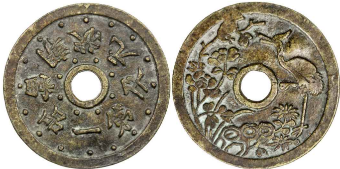
818. QING: AE charm (18.49g), CCH-812, 45mm, yi pin dang chao zhuang yuan ji di ([may you be] an official of the first degree at the imperial court and first rank at the examination for the Hanlin Academy) // stork, small bird, and flowers, VF-EF $75 - 100