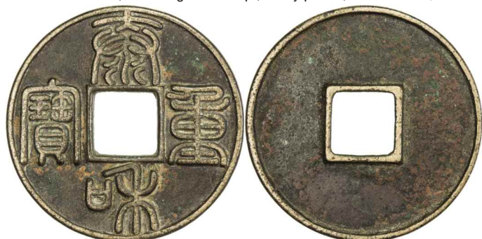
771. JIN: Tai He , 1204-1209, AE 10 cash (18.16g), H-18.63, seal script, fine casting style as usual, EF $250 - 350