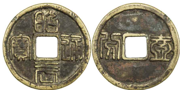
778. NAN MING: Zhao Wu , 1678, AE 10 cash (10.89g), H-21.111, seal script, yi fen on reverse, a pleasing example, VF $100 - 150