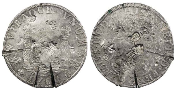
950. MEXICO: Carlos III , 1759-1788, AR 8 reales, 1764-Mo, KM-105, 'pillar dollar' or 'columnario' type, assayer MF, with test-cuts and numerous large and small Chinese chopmarks on both sides, AU $100 - 150