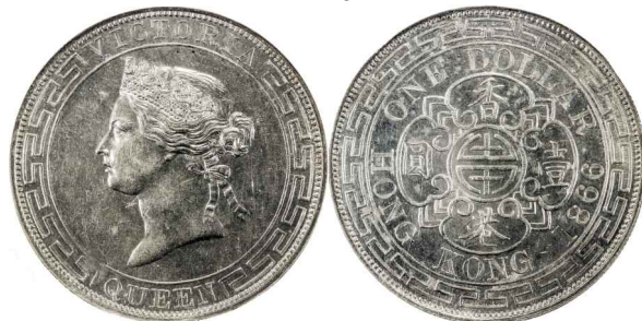
980. HONG KONG: Victoria, 1841-1901, AR dollar, 1866, KM-10, gorgeous strike with prooflike surfaces, NGC graded AU55, R $2,200 - 2,600

In an old NGC slab - would undoubtedly be graded higher today, at least AU-58 and perhaps MS-60.