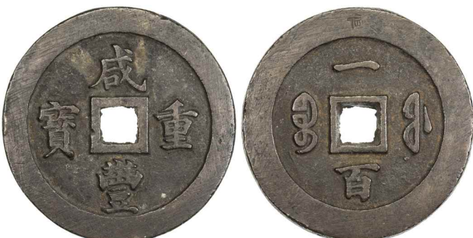
789. QING: Xian Feng , 1851-1861, AE 100 cash, Fuzhou mint, Fujian Province, H-22.800, 71mm, cast 1853-55, tóng (copper) color, one merchant chopmarks on rim, VF $1,200 - 1,400