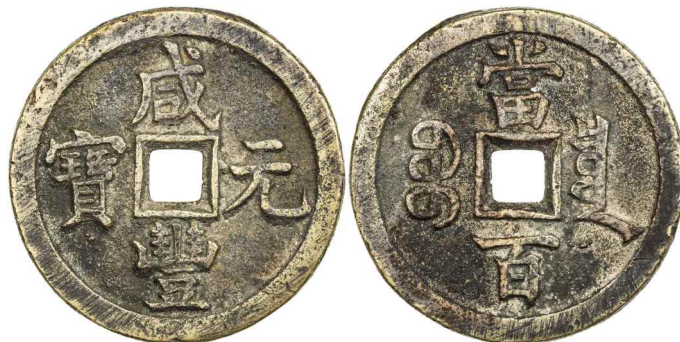
784. QING: Xian Feng , 1851-1861, AE 100 cash (43.62g), Board of Revenue, Peking, H-22.710, 48mm, West branch mint, cast 1854-55, brass ( huang tong ) color, VF-EF $90 - 110