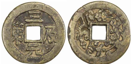
815. QING: AE charm (6.15g), CCH-613, san yuan ji di (luck for examinations for the Hanlin Academy) // stylized phoenix and dragon, , ex Daniel K. Ching Collection $75 - 100