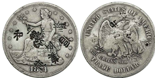
969. UNITED STATES: AR trade dollar, 1874-S, with many large Chinese chopmarks either side, VF $100 - 150