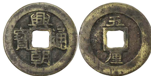
776. NAN MING: Xing Chao , 1648-1657, AE 5 cash (6.34g), H-21.12, wu li (five li [of silver]) on reverse, scarce variety, F-VF $75 - 100

Toghon Temür, also known by the posthumous name Shundi, bestowed by the Hongwu Emperor of the Ming Dynasty, was a son of Kus'ala who ruled as emperor of the Yuan Dynasty and is considered the last Khagan of the Mongol Empire. He bore the period titles Yuan Tong 1333-1334, Zhi Yuan 1335-1340, and Zhi Zheng 1341-1368.