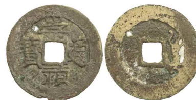
775. MING: Chong Zhen , 1628-1644, AE cash (2.89g), H-20.355, horse running left at bottom reverse, small casting hole, Fine $75 - 100