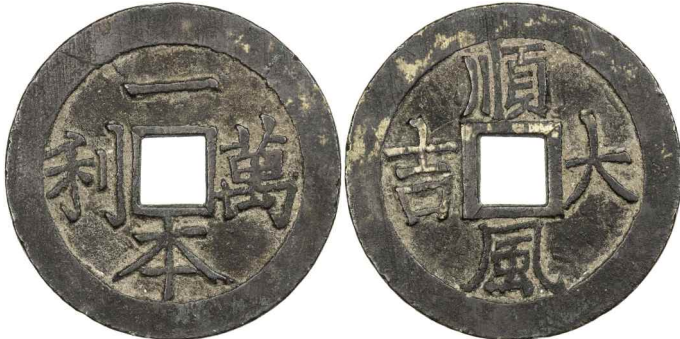
837. QING: AE charm (18.49g), CCH-1539 var, 45mm, yi ben wan li (small investment brings big [10,000 fold] profit) // shun feng da ji (may you have a favorable wind and good luck), VF-EF $75 - 100