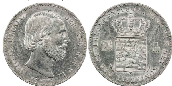
953. NETHERLANDS: William III , 1849-1890, AR 2½ gulden, 1858, KM-82, with two large but subtle Chinese chopmarks on reverse, lustrous AU $100 - 150

Netherlands coins are difficult to find chopmarked from China.