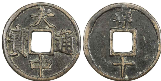
774. MING: Da Zhong , 1361-1368, AE 10 cash, Hubei Province, H-20.50, 47mm, é above on obverse, shih below on reverse, a lovely specimen! Fine, RR $800 - 1,000

From an old Japanese collection. ex Stephen Album auction 23 lot 807. Photo size reduced.