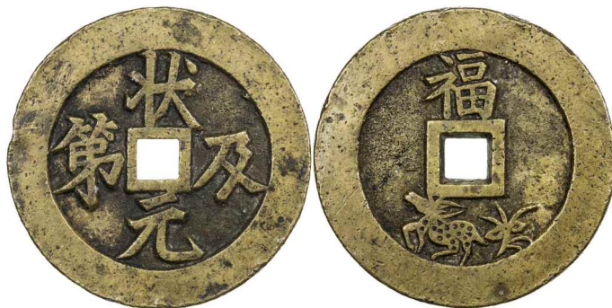
819. QING: AE charm (46.55g), CCH-908, 52mm, zhuang yuan ji di ([may you be] the first rank at the examination for the Hanlin Academy) // character fu above deer & sprig, EF $75 - 100