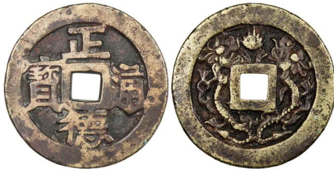
812. QING: AE charm (58.88g), CCH-380 var, 57mm, zheng de tong bao // double dragons, flaming pearl above , Fine $75 - 100