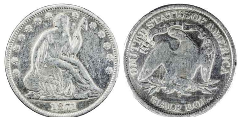
964. UNITED STATES: AR 1/2 dollar, 1871-S, Seated Liberty type with one large Chinese chopmark on reverse, cleaned, Fine $75 - 100

United States half dollars are difficult to find chopmarked from China.