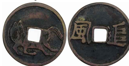
830. QING: AE charm (4.34g), CCH—, horse gaming charm, zhui feng // horse left, unpublished in the Classic Chinese Charms volumes, Fine , ex Daniel K. Ching Collection $75 - 100