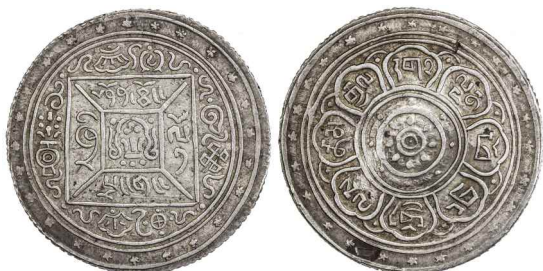
996. TIBET: Xuan Tong , 1909-1911, AR srang, Dode, year 1 (1909), Y-9, L&M-657, small reverse scratch, still a very attractive specimen, NGC graded AU details $1,700 - 1,900