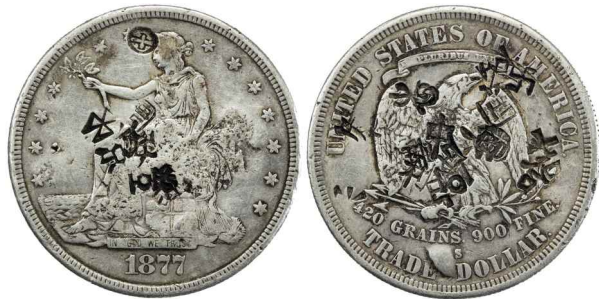
975. UNITED STATES: AR trade dollar, 1877-S, with many large Chinese chopmarks either side, VF $100 - 150