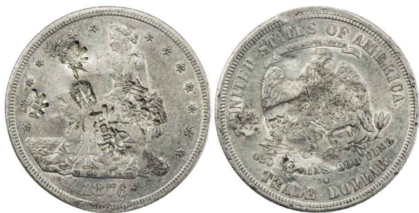
972. UNITED STATES: AR trade dollar, 1876-S, with many large Chinese chopmarks either side, EF-AU $125 - 175