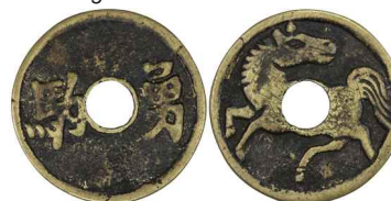
832. QING: AE charm (2.63g), CCH—, horse gaming charm, unread character and ma // horse left, unpublished in the Classic Chinese Charms volumes, Fine , ex Daniel K. Ching Collection $75 - 100