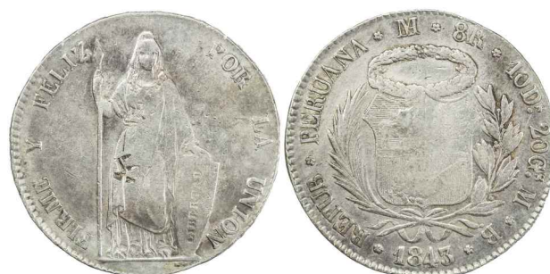
955. PERU: AR 8 reales, Lima, 1843, KM-142.10, assayer MB, with two large Chinese chopmarks on obverse, VF $75 - 100