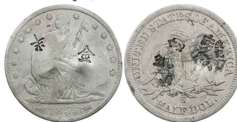
961. UNITED STATES: AR ½ dollar, 1855-S, Seated Liberty type with arrows type, with two large Chinese chopmarks on obverse and several small and large marks on the reverse, F-VF $100 - 150

United States half dollars are difficult to find chopmarked from China.