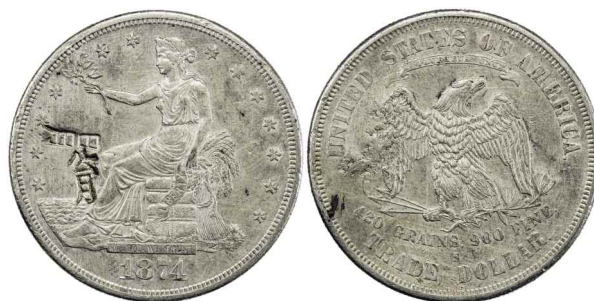
967. UNITED STATES: AR trade dollar, 1874-S, with two medium Chinese chopmarks, each with two characters, EF $125 - 175