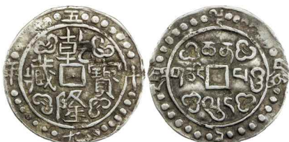
993. TIBET: Qian Long , 1736-1795, AR sho (3.43g), year 59 (1794), Cr-72, L&M-638B, lightly crimped, VF $100 - 150