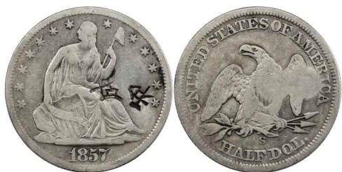
962. UNITED STATES: AR 1/2 dollar, 1857-S, Seated Liberty type with two large Chinese chopmarks on obverse, Fine $100 - 150