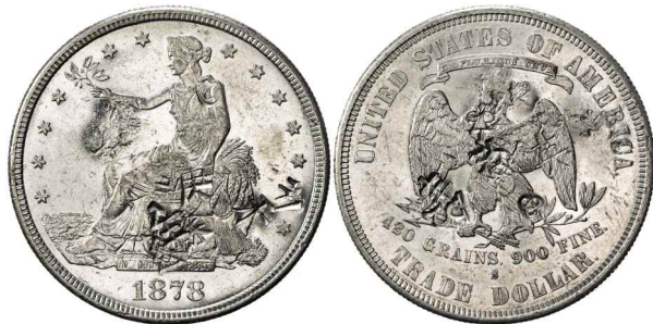
976. UNITED STATES: AR trade dollar, 1878-S, with several large Chinese chopmarks either side, lustrous UNC $200 - 250