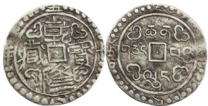
991. TIBET: Qian Long , 1736-1795, AR sho (3.22g), year 58 (1793), Cr-72, L&M-638, lightly clipped, VF $100 - 150