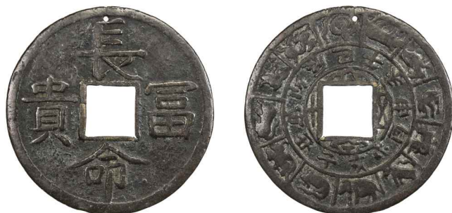
827. QING: AE charm, CCH—, 60mm, chang ming fu gui (longevity, wealth and honor) // the twelve Earthly Branches associated with each month of the year, zi, chou, yin, mao, chen, si, wu, wei, shen, you, xu, hai around lunar animals, small hole and some minor flan cracks, Fine $75 - 100

Likely cast in the Ming Dynasty by style and metal. Photo size reduced.