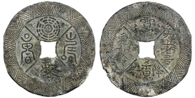
839. QING: tin charm (15.17g), CCH-1764 var, 42mm, Lei Ting Daoist (Taoist) Curse Charm with decorated border, light corrosion, VF $75 - 100

An interesting piece, strikingly different from charms normally found in China.