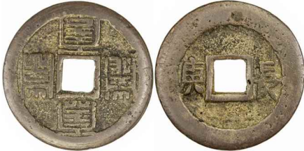
836. QING: AE charm (6.31g), CCH-1167, "Chang Geng" charm, seal script obverse and orthodox script on reverse, cast in Yunnan Province, VF, ex Daniel K. Ching Collection $75 - 100