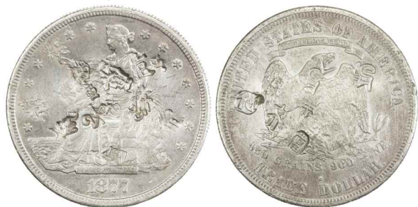
974. UNITED STATES: AR trade dollar, 1877-S, with many large Chinese chopmarks, EF $125 - 175