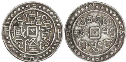
992. TIBET: Qian Long , 1736-1795, AR sho (3.63g), year 59 (1794), Cr-72, L&M-639, 28 pellets in 4 groups of 7 each, bold strike, well-centered, choice VF $150 - 200