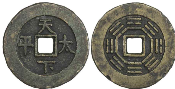
822. QING: AE charm (16.96g), CCH—, tian xia tai ping (peace under heaven) / the Chinese eight trigrams ( bagua ), some rim bumps, VF $100 - 150

Likely a contemporary issue, as the fabric, manufacturing style, and metal are consistent with the period for the late 19th century.