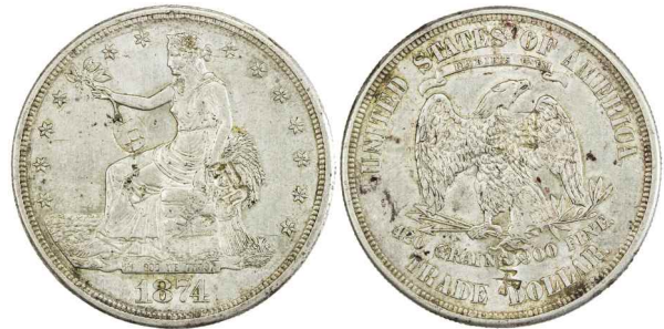
966. UNITED STATES: AR trade dollar, 1874-S, several large Chinese chopmarks, AU $150 - 200