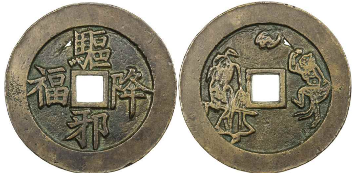
842. QING: AE charm (40.45g), CCH-1899, 52mm, qu xie jiang fu (expel evil and send down good fortune) // Zhong Kui (daemon slayer), tiny natural casting hole, EF $75 - 100