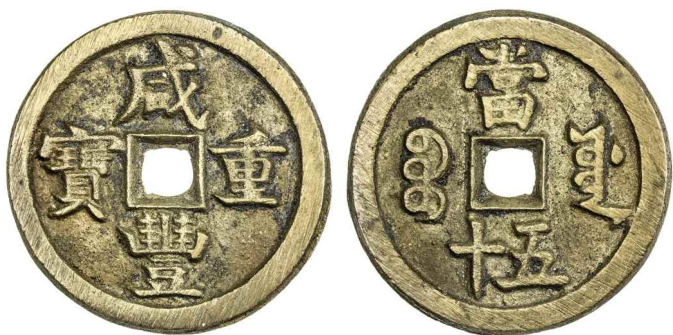
786. QING: Xian Feng , 1851-1861, AE 50 cash (34.31g), Board of Works, Peking, H-22.760, 44mm, New branch mint, cast 1854, brass ( huáng tóng ) color, VF-EF $80 - 100