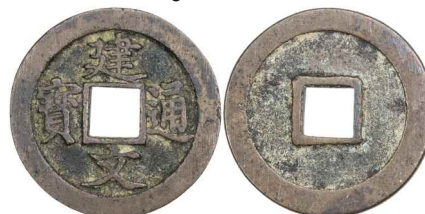
811. QING: AE charm (5.02g), 26mm, jian wen tong bao , fantasy nien hao for a ruler that did not issue coins $75 - 100