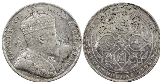
960. STRAITS SETTLEMENTS: Edward VII , 1901-1910, AR dollar, 1909, KM-26, with two Thai language merchant chopmarks, both within rectangles, EF $100 - 150