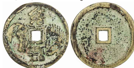
831. QING: AE charm (7.73g), CCH—, horse gaming charm, two unread characters above and below horse right, unpublished in the Classic Chinese Charms volumes, Fine , ex Daniel K. Ching Collection $75 - 100