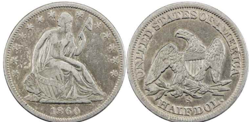
963. UNITED STATES: AR 1/2 dollar, 1860-S, Seated Liberty type with two character incuse Chinese chopmark on obverse, F-VF $100 - 150