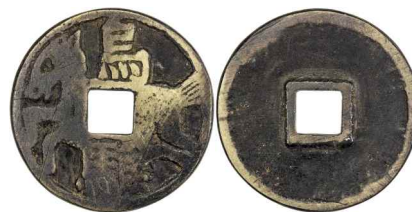
828. QING: AE charm (4.05g), CCH—, horse gaming charm, ma zhui above and below horse right, unpublished in the Classic Chinese Charms volumes, Fine , ex Daniel K. Ching Collection $75 - 100

Likely cast in the Ming Dynasty by style and metal. Photo size reduced.