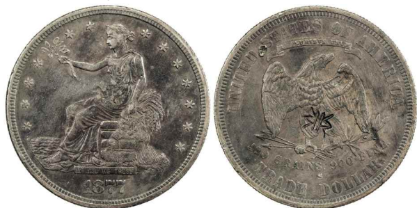
973. UNITED STATES: AR trade dollar, 1877-S, with one large Chinese chopmarks on reverse, toned EF-AU $150 - 200