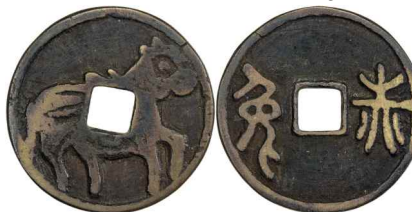
829. QING: AE charm (4.34g), CCH—, horse gaming charm, two unread characters, horse right, unpublished in the Classic Chinese Charms volumes, Fine , ex Daniel K. Ching Collection $75 - 100