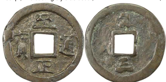
772. YUAN: Zhi Zheng , 1341-1368, AE 3 cash (11.73g), H-19.109, Mongolian 'Phags-pa sam above and Chinese san below on reverse for denomination, Fine $100 - 150

Toghon Temür, also known by the posthumous name Shundi, bestowed by the Hongwu Emperor of the Ming Dynasty, was a son of Kus'ala who ruled as emperor of the Yuan Dynasty and is considered the last Khagan of the Mongol Empire. He bore the period titles Yuan Tong 1333-1334, Zhi Yuan 1335-1340, and Zhi Zheng 1341-1368.