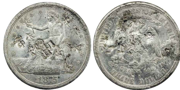
970. UNITED STATES: AR trade dollar, 1875-S, with many large Chinese chopmarks either side, AU $150 - 200