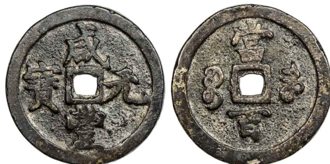
790. QING: Xian Feng , 1851-1861, AE 100 cash (48.81g), Kaifeng and others, Henan Province, H-22.848, 48mm, small characters, cast 1854-1855, VF $75 - 100