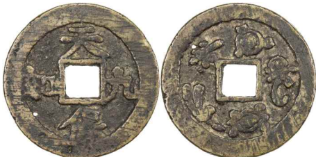
816. QING: AE charm (6.58g), CCH-672, 28mm, tian bao jiu ru (Fortune as vast as the East Sea) // two uncertain symbols, tiny natural casting hole, VF , ex Daniel K. Ching Collection $75 - 100