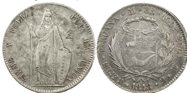
956. PERU: AR 8 reales, Lima, 1848, KM-142.10, assayer MB, with Chinese chopmark yín (silver) in obverse field, EF, RR $200 - 300

This type is very rarely found with Chinese merchant chopmarks.