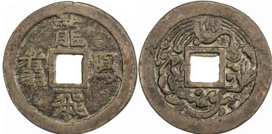
817. QING: AE charm (8.49g), CCH-696 var, long fei feng zhu (the dragon flies and the phoenix soars) // dragon & phoenix, VF , ex Daniel K. Ching Collection $75 - 100