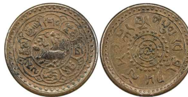
1001. TIBET: AE 2 1/2 skar , BE15-52 (1918), Y-16, superb quality for type, EF-AU $75 - 100