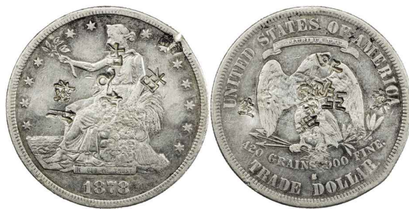
977. UNITED STATES: AR trade dollar, 1878-S, with many large Chinese chopmarks either side, VF $100 - 150