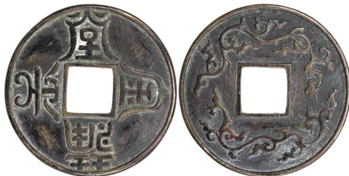
821. QING: AE charm, CCH-933 volume II, 56mm, jin yu man tang (may gold and jade fill your house [halls]) in seal script // ornate branches based on a dragon & phoenix prototype, Fine, R $75 - 100