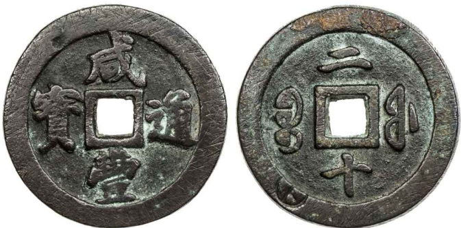
787. QING: Xian Feng , 1851-1861, AE 20 cash (41.64g), Fuzhou, Fujian Province, H-22.781, 46mm, one dot tong , cast 1853-55, interesting chopmark on reverse margin, F-VF $75 - 100