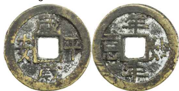
825. QING: AE charm (3.89g), sui sui ping an // nian nian ru yi , VF , ex Daniel K. Ching Collection $75 - 100