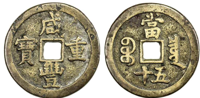
783. QING: Xian Feng , 1851-1861, AE 50 cash (32.40g), Board of Revenue, Peking, H-22.707, 46mm, West branch mint, cast 1854-55, brass ( huang tong ) color, VF $70 - 100