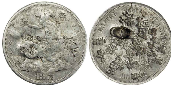
971. UNITED STATES: AR trade dollar, 1875-S, with many large Chinese chopmarks either side, and one testmark on reverse, AU $100 - 150