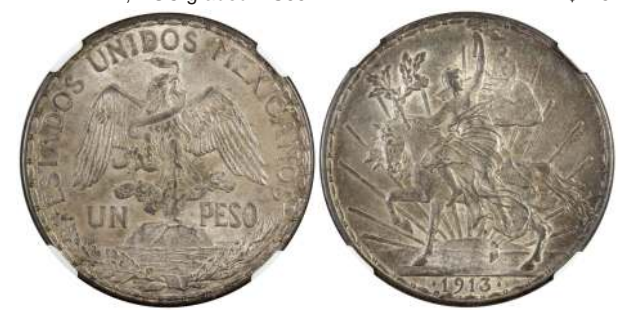
2592. MEXICO: Estados Unidos, AR peso, 1913, KM-453, "Caballito" series, lovely toning, NGC graded MS65 $1,100 - 1,300