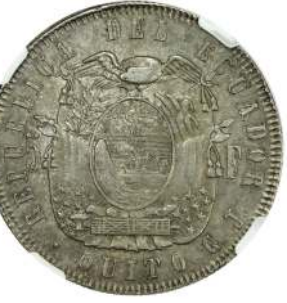
2533. ECUADOR: Republic, AR 5 francos, 1858, KM-39, assayer GJ, mintage unrecorded, but surviving documents suggest a possible total mintage of just over 14,000 pieces, of which few have survived, NGC graded AU58, R $2,750 - 3,250

Designed by the Ecuadorian artist Emilia Rivadaneira, indicated by "E.R." below bust.