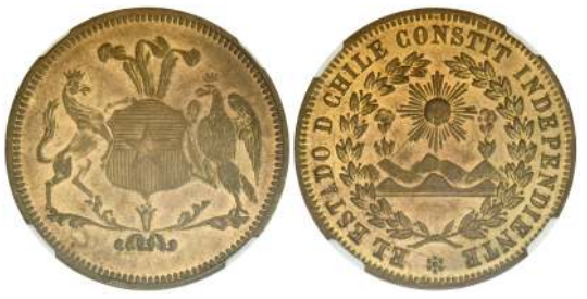
2515. CHILE: Republic, bronze 8 escudo pattern, ND, KM-Pn3, struck by the Paris company Trelon, Weldon et Weil, which was founded in 1844, lightly gilt, NGC graded AU58, RRR $800 - 1,000

Incorrectly called KM-PnA4 (1835) on the slab, but could not have been produced before 1844.