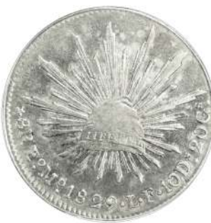
2560. MEXICO: República , AR 8 reales, 1829-EoMo, KM-377.5, assayer LF, PCGS graded AU50 $2,200 - 2,600

Very rare mint, in operation only between 1828 and 1830.