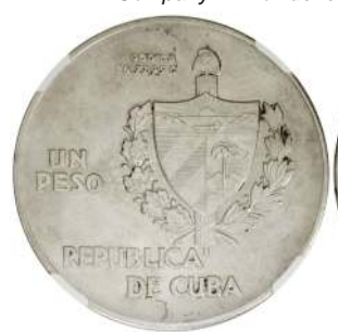
Type II souvenir pesos were struck at the Gorham Manufacturing Company in Providence, Rhode Island, USA.