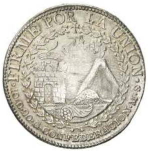
DANISH WEST INDIES: AR 8 reales, ND, KM-X47, fantasy countermark, with a script FR VII for Frederik VII of Denmark on Peru 8 reales, Cuzco mint, 1838, type KM-170.4, EF on EF host. R