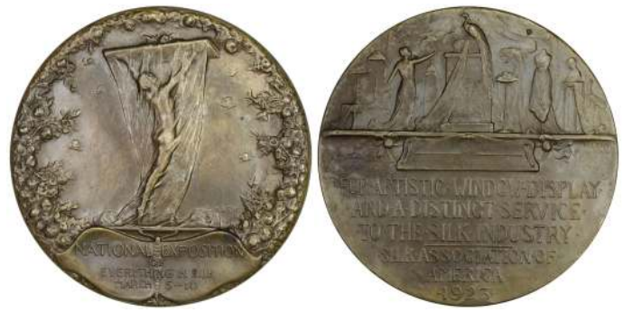
2629. UNITED STATES: 1923 AE medal, 63mm, lovely Art Nouveau medal by Hungarian-born American medalist Julio Kilenyi, NATIONAL EXPOSITION OF EVERTHING IN SILK, MARCH 5-10, nude female figure silhouetted behind silk curtain, silkworm moths flutter around, border of white mulberry studded with silkworm cocoons / FOR ARTISTIC WINDOW DISPLAY AND A DISTINCT SERVICE TO THE SILK INDUSTRY - SILK ASSOCIATION OF AMERICA, 1923, peacock on pedestal, woman in silk gown amongst various racks displaying silk wares, a gorgeous medal, EF, R $75 - 100