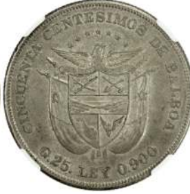
PANAMA: Republic, AR 50 centesimos, 1905, KM-5, 2615. NGC graded AU55