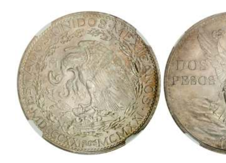
2594. MEXICO: Estados Unidos, AR 2 pesos, 1921, KM-462, Centennial of Independence, lovely golden toning, NGC graded MS65 $1,100 - 1,300