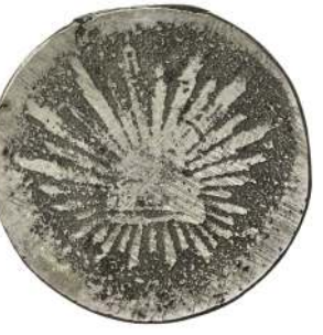
SINALOA: AR peso (27.63g), ND, KM-768, GB-406, 2608. sand molded using 8 reales of type KM-377, possibly dated 1897, VF