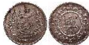
92464. TUNISIA: AR 50 centimes, 1895-A/AH1313, KM-223, mintage of only 1,000, ef $800

Silver coins of 50 centimes were struck in large quantities occasionally, but in all other years 1891-1928 in small quantities for presentation purposes, either 1000 or 1003 pieces (except 1923, with 2009 pieces). Most were either never distribution or used in ordinary circulation, with the result that the presentation dates are much rarer than their mintage of 1000 each year would indicate.