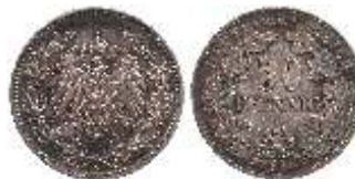
823387. GERMANY: AR 50 pfennig (2.76g), 1898 A, KM-15, choice ef $350

Normal issues of 50 pfennig were struck 1875-1878, the last year very rare, followed by a limited edition 1896-1903, all very rare. Normal production of this denomination resumed in 1905, as 1/2 mark rather than 50 pfennig.