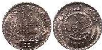
827027. SYRIA: CN 1/2 piastre (4.07g), Paris, 1921 (a), KM-68, very rare in this condition, unc $100