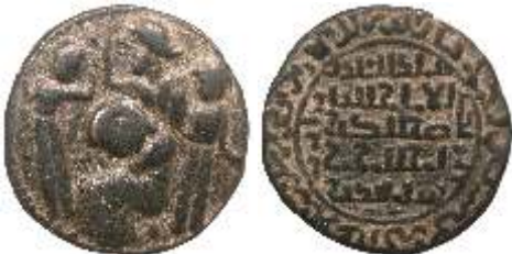
91954. ARTUQIDS OF MARDIN: Yuluq Arslan , 1184-1201, AE dirham (12.73g), [Mardin], AH590, A-1829.3, SS-35.3, "lamentation" scene, nice unusually well-centered strike with no weakness, vf $130