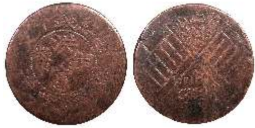
93722. SINKIANG: AE 10 cash, Kashgar, AH1334, Y-A38.1, Hong Xian Tong Bi , crossed Republican flags, long bi type, crude f, RR $300