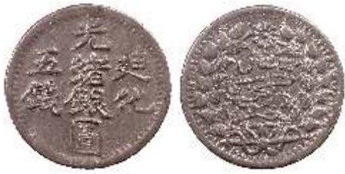
76174. SINKIANG: AR 5 miscals, Urumqi, AH1323, in the name of Kuang Hsu, Y-35, choice ef-au $155