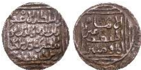
88714. BENGAL: Kaika'us , 1290-1300, AR tanka (10.98g), Lakhnauti, DM, G-B89, nice strike, vf-ef $110