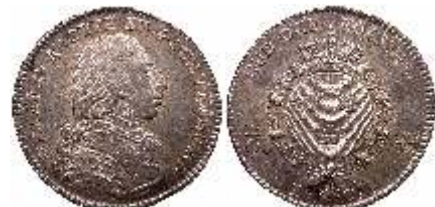
91927. SWEDEN: AR 1/6 riksdaler (6.19g), 1807 OL, KM-560, mintmaster OL, beautifully toned, cracked reverse die, unc, R $300