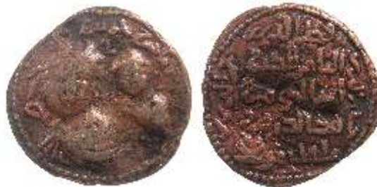
821954. ARTUQIDS OF MARDIN: II-Ghazi II , 1176-1184, AE dirham (16.21g), NM, AH580, A-1828.2, SS-32.4, large & small draped busts facing, rare date, f-vf $100