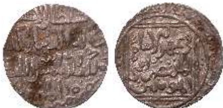
88706. BENGAL: Queen Raziyya , in Bengal, 1236-1240, AR tanka (10.77g) (Lakhnauti), AH63x, G-B57, excellent strike, vf-ef, R $800