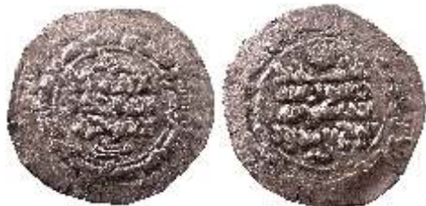
87961. SAMANID: Nuh III , 976-997, AR dirham (3.78g), Samarqand, AH367, A-1470, SNAT-865, citing Makki below obverse, allegedly referring to a governor from Makka in Arabia, bold mint & date, choice vf, R $150

This is an extremely important coin, because of its clear date, the earliest known date for any multiple dirham, except for a few extremely rare issues struck with dirham obverse dies imported of stolen from the mints of Bukhara and Samarqand. In my opinion, AH363 is probably the year when the multiple dirhams were first struck.