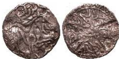
88763. BENGAL: Muhammad Shah , 2nd reign, 1418-1432, AR tanka (10.60g), NM, ND, G-B342, lion right on reverse, many test marks on obverse & 4 small banker's marks on lion side, vf, RR $300