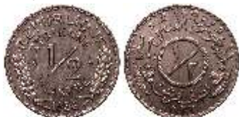
827028. SYRIA: CN 1/2 piastre (4.10g), Paris mint, 1936 (a), KM-75, choice unc $140