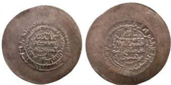
86321. SAMANID: Nuh III , 976-997, AR multiple dirham, Walwaliz, AH370, A-1469W, SNAT-1251/53, 7.32g, citing Fa'iq, excellent strike, ef-au, R $200