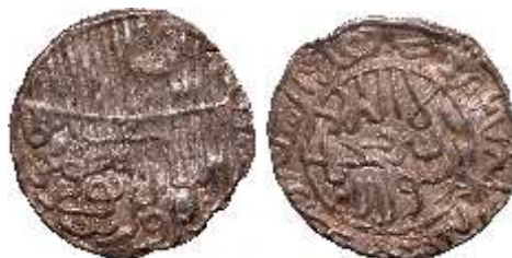
88753. BENGAL: Muhammad Shah , 2nd reign, 1418-1432, AR tanka (10.72g), Dakhil Banjaliya, AH827, G-B348, toughra obverse, bold strike, with clear mint & full date, 2 banker's marks & 1 testmark, lovely ef, RR $250