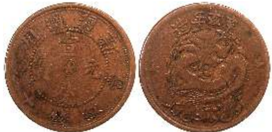
89256. SINKIANG: AE 10 cash, CD1911, Y-2.3, in the name of Hsuan Tung, star within circles on obverse, attractive f $200

This type was extremely rare until after the reintroduction of trade with China in the 1970s. When several hundred, perhaps several thousand, came to the US in the early 1980s, the price collapsed. Those have long since been disbursed, and there is no longer a supply in Xinjiang.