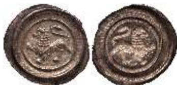
821990. Saxony: Heinrich der Löwe , 1142-1195, AR bracteate (0.49g), Lüneburg, ND, Kestner Museum 361, lion walking left, bold strike, ef $220