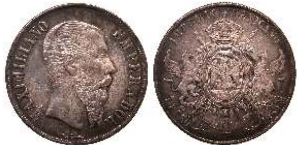
826927. MEXICO: Maximilian, AR pes0 (27.16g), 1866 Mo, KM-388.1, vf-ef $100

The pillar dollar, "ocho reales", struck at the Spanish colonial mints in South and Central America from 1732 to 1771, has always been on the most popular coins amongst collectors in the United States, as together with the portrait dollar of Spanish America it became the standard currency of the United States. Technically, the United States dollar replaced the Mexican eight real coins as the US official currency only in 1857.