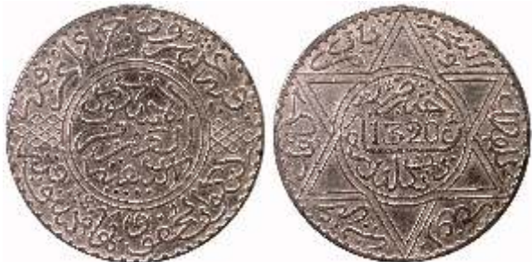
826946. MOROCCO: AR 10 dirhams (24.91g), Birmingham mint, AH1320, Y-22.1, ef $150