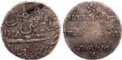
89794. JAVA: AR rupee, AH1228, KM-247, British Occupation issue of 1813, f $185