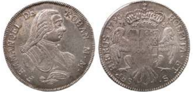
826926. MALTA: Emmanuel de Rohan, 1775-1797, AR 30 tari (29.34g), 1790, KM-327, choice ef $685