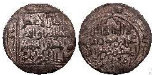
88704. BENGAL: Iltutmish , in Bengal, 1230-1236, AR tanka (10.67g) (Lakhnauti), AH6xx, G-B47, usual weakness, pleasing vf, RR $225