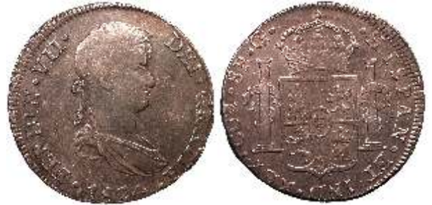
94744. PERU: AR 8 reales, Cuzco, 1824, KM-117.2, assayer G, usual weakness of strike, ef, R $600