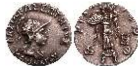
93262. INDO-GREEK: Menander, 160-145 BC, AR drachm (2.47g), Pushkalavati, Mitch-1780, helmeted & draped bust right, Greek legend / Kharosthi legend, Athena advancing left, bearing shield and thunderbolt, choice ef $150