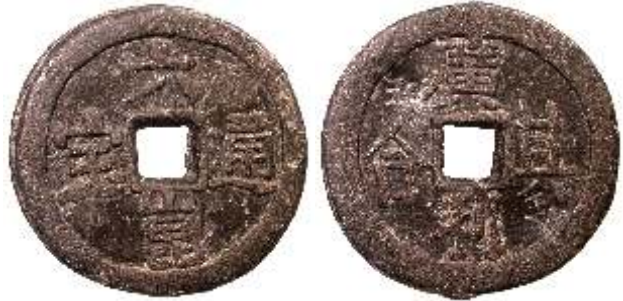
93752. LIGOR: lead ¼ bia, ND (ca. 1880-95), Pridmore-226, Lu K'un Tung Pao (Money of Lakhon [Ligor]), abbreviated pao / Kuang Li Ch'i Ho , 2 Chinese chopmarks on reverse, hé quán , vf, RR $300 Pridmore mentions that no specimen of this type has been traced for examination or illustration.