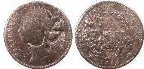
91165. NEJD: AR rupee, ND, KM-X7, countermarked nejd on 1840 East India Company rupee of Victoria K-458 type, f, S $300 This countermark is considered by many to be a spurious issue.