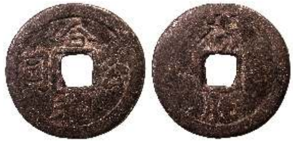
93749. LIGOR: lead ¼ bia, ND (ca. 1880-95), Pridmore—, He Li Kung Ssü (Double Harmony company) / with two uncertain characters, one incuse, with two additional Chinese chopmarks, f, RRR $325

Value is ¼ bia with 10 bia equalling 1 dollar, thus 40 of these large coins made one dollar. Pridmore mentions that no specimen of this type has been traced for examination or illustration.