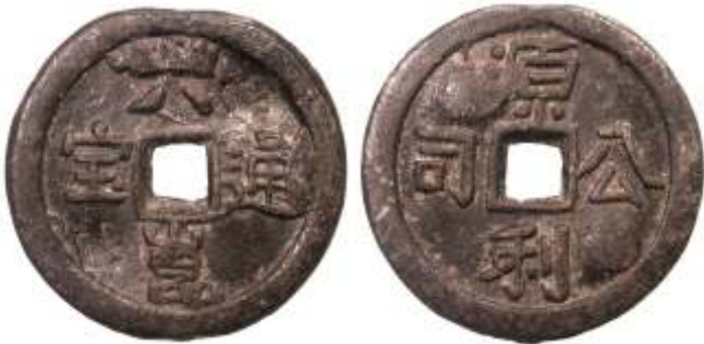
93758. LIGOR: lead ¼ bia (23.60g), ND (ca. 1880-95), Pridmore-226, Lu K'un Tung Pao (Money of Lakhon [Ligor]), abbreviated pao / Kuang Li Ch'i Ho , with two Chinese chopmarks on obverse hé hé , f-vf, RR $275 Pridmore mentions that no specimen of this type has been traced for examination or illustration.