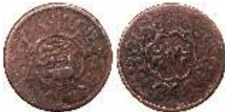
827033. TIBET: AE 5 skar (3.30g), BE 56-15 (error for 15-56), Y-19, f-vf $150