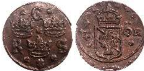
87252. SWEDEN: AE ¼ öre, Sater, 1637, KM-160, choice ef $120