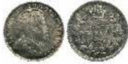
825617. CANADA: AR 5 cents (1.16g), 1907, KM-13, bu $150