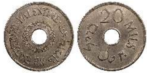
89365. PALESTINE: 20 mils, 1941, KM-5, key date, ef-au $220