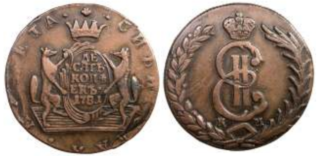
67336. SIBERIA: AE 10 kopecks, Kolyvan, 1781, Cr-6, good strike, small flan defect in reverse center, choice vf $425

Coin image is approximately 90% of actual size.