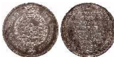
94612. GREAT BRITAIN: AR shilling token , 1811, Bristol silver shilling token, Obverse: A circular view of the castle and a ship (left) within an inscription, buckled band, crest above. On buckled band: 'VIRTUTE ET INDUSTRIA'. Legend: 'BRISTOL TOKEN FOR XII PENCE'. Reverse: Inscription, 'PAYABLE BY MESSRS FRAS GARRATT WM TERRELL EDWD BIRD LANT BECK & FRANS. H. GRIGG.' Legend: 'TO FACILITATE TRADE. ISSUED IN BRISTOL AUGT 12 1811.', au $100