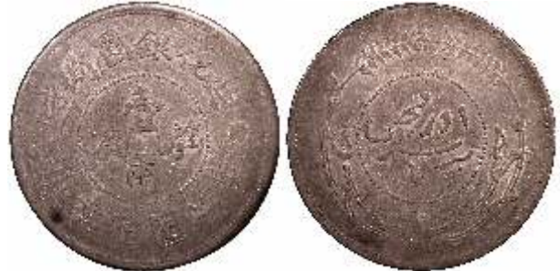
826820. SINKIANG: Republic: AR sar (tael) of 35.0g, Urumqi, year 6 (1917), Y-45.1, ef $150

This type was extremely rare until after the reintroduction of trade with China in the 1970s. When several hundred, perhaps several thousand, came to the US in the early 1980s, the price collapsed. Those have long since been disbursed, and there is no longer a supply in Xinjiang.