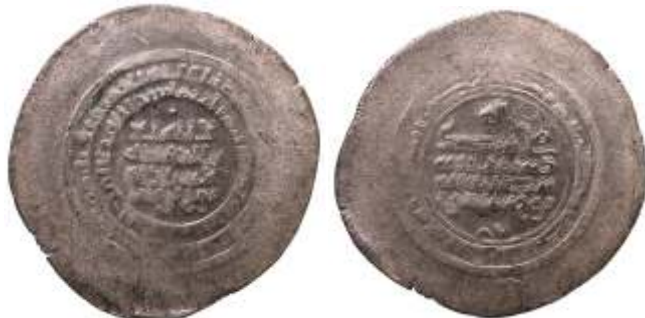
84964. SAMANID: Nuh III , 976-997, AR multiple dirham, NM, AH363, A-1469.2, SNAT-375var, 9.65g, clear inscription ... hadha al-dirham sana thalath wa sittin wa thalathmi'a in inner obverse marginal legend, but very important for dating of system, as this cites Nuh III in reverse as usual and Nuh II below obverse field, lustrous ef, RRR $350

This is an extremely important coin, because of its clear date, the earliest known date for any multiple dirham, except for a few extremely rare issues struck with dirham obverse dies imported of stolen from the mints of Bukhara and Samarqand. In my opinion, AH363 is probably the year when the multiple dirhams were first struck.