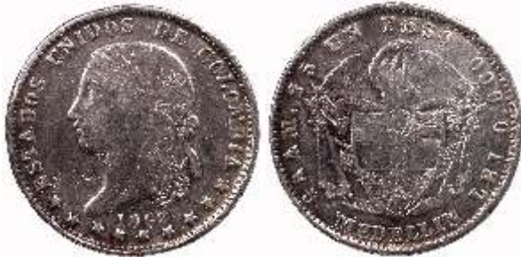
90183. COLOMBIA: AR peso, Medellin, 1869, KM-154.2, some minor rim bumps, scarce mint & type, f-vf $200