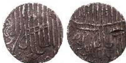
88847. BENGAL: Muhammad Shah , 2nd reign, 1418-1432, AR tanka (10.45g), NM, ND, G-B370, toughra on both sides, bold strike, 4 testmarks (2 each side), good vf, S $145