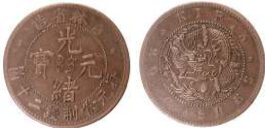
85928. KIRIN: AE 20 cash, ND (1903), Y-178, CCC-485, in the name of Kuang Hsu, narrow characters variety, vf, ex. Viking Collection, Hong Kong Auction 47, lot 611 (part) $165