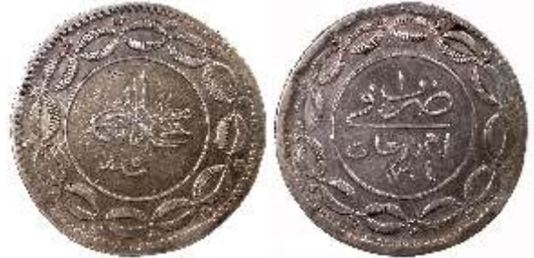
90212. SUDAN: AR 20 piastres, Omdurman, AH1304 year 5, KM-7.1, choice vf $110