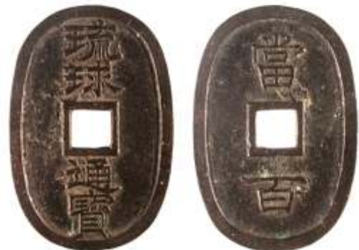
71982. RYUKYU ISLANDS: AE 100 mon, ND (1862), Cr-100, Okinawa Provincial coinage, vf $175