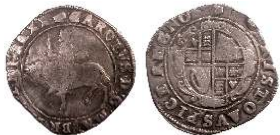
82868. ENGLAND: Charles I , 1625-1649, AR halfcrown, Tower mint, ND, S-2717, N-2209, king on horse left / Shield of arms, mintmark above, centered on irregular flan, f $185