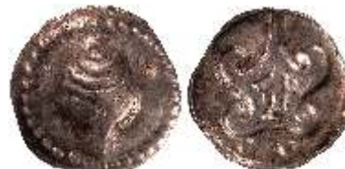
85996. THAILAND: Hamsavati: Anonymous, ca. 5th-6th century, AR 88 ratti (9.35g), Mitch-1998:516, sankh shell / yupa within temple, two circles below, type 7, ef, S $185