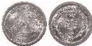
826834. DJIBOUTI: AL 5 centimes (0.90g), 1921, KM-Tn5, choice au-unc, R $300