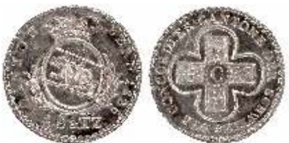
825843. Bern: AR 5 batzen (4.44g), 1826, KM-196.1, bu $185