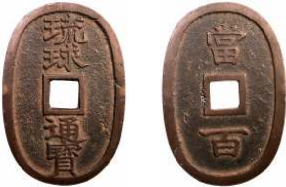
94143. RYUKYU ISLANDS: AE 100 mon, ND (1862), Cr-100, local oval-shaped provincial issue, vf $120