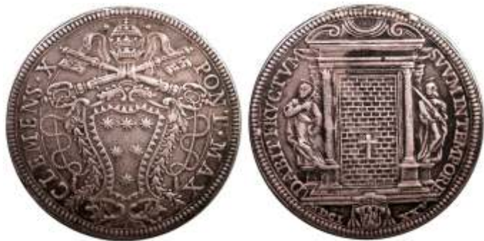
91044. Papal States: AR piastra, 1675, KM-371, Dav-4081, arms of Pope Clement X / Holy Year theme, dated MDCLXXV, mount removed and expertly repaired, it is difficult to find the repair work, vf-ef $550