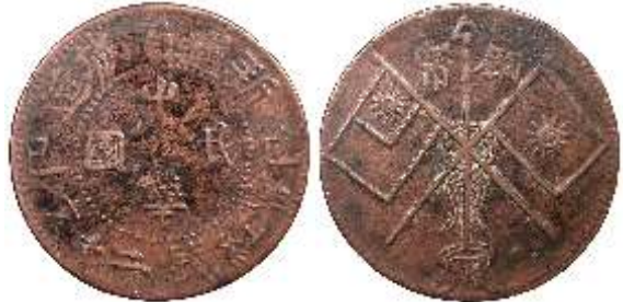
93727. SINKIANG: AE 20 cash, CD1929, Y-A41.1, crossed Nationalist flags, tong bi (copper coin) either side, vf, RR $300