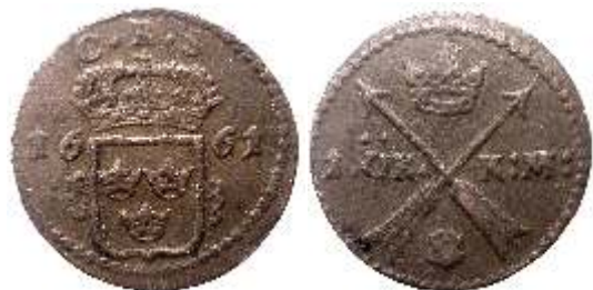
87254. SWEDEN: AE öre, Avesta, 1661, KM-232.1, lovely vf, S $150