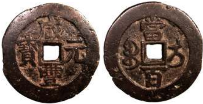
87352. CH'ING: Xian Feng , 1851-1861, AE 100 cash, Ili mint, Xinjiang Province, H-22.1091, Cr-28-8, cast in 1854-55, attractive f-vf, R $225

Coin image is approximately 80% of actual size.