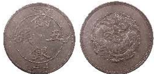
810226. SINKIANG: AR 5 miscals, ND (1905), Y-6, time of emperor Kuang Hsu but without his name, Ma-820, ef $200