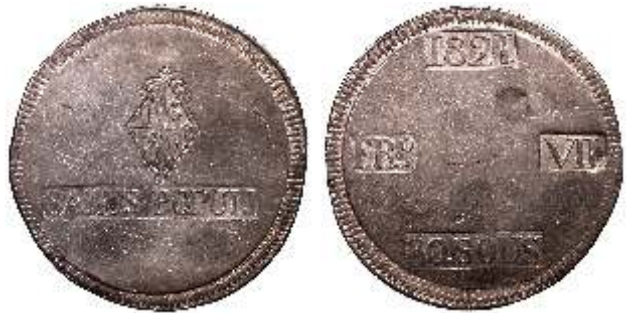
94773. Majorca: AR 30 sous, 1821, Cribb-L53.1, countermarked type of Ferdinand VII, ef $325

Salus Populi, "for the good of the people". "30 Sous" refers to the local denomination, equal to one duro, the local crown of the islands. Similar coins had been produced in 1808-1809, in Majorca as well as Gerona, Lerida, Tarragona & Tortosa.