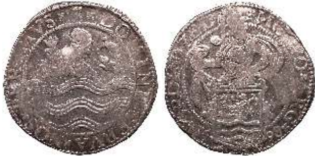
826968. Zeeland: AR leeuwendaler (lion dollar) (27.08g), 1598, Dav-8870, lion behind waves of the sea, vf $300