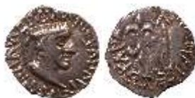
88487. KSHAHARATA: Nahapana, ca. 105-124, AR drachm (1.95g), Mitch-1253, elderly portrait, reasonably good full Greek inscription around / arrow & thunderbolt within Brahmi inscription, choice ef $110