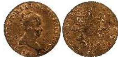
825710. SPAIN: Isabel II, 1833-1870, AE 4 maravedis (3.98g), Jubia, 1847 JA, KM-530.2, unc $100