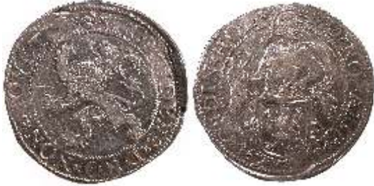
826966. NETHERLANDS: Holland: AR ½ leeuwendaler (lion dollar, =48 stuivers) (13.36g), 1604, KM-9, choice vf $365