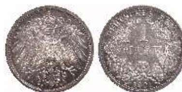
823382. GERMANY: AR mark (5.53g), 1901 F, KM-14, choice unc $200