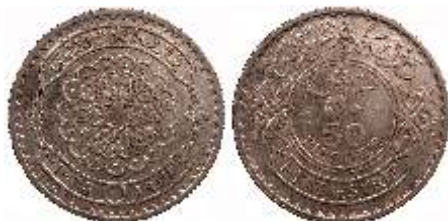
90150. SYRIA: AR 50 piastres, Paris, 1933, KM-74, au $115