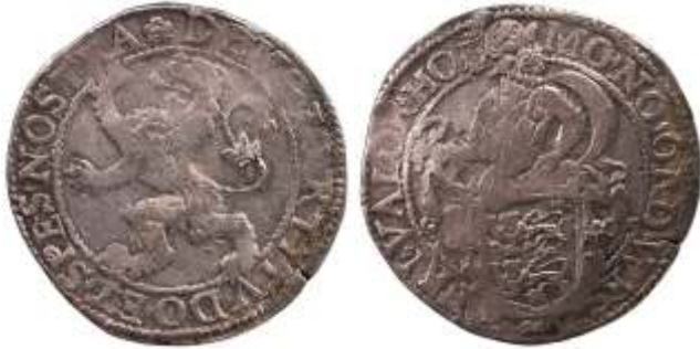
826967. West Friesland: AR leeuwendaler (lion dollar) (26.52g), 1605, KM-12, vf $250