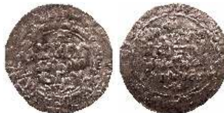
87014. SAMANID: Nuh III , 976-997, AR dirham (2.39g), Bukhara, AH374, A-1470, SNAT-195, citing sa'id below obverse, choice ef $100