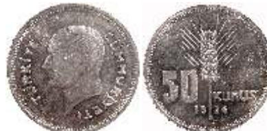
825859. TURKEY: AR 50 kurus (5.90g), 1936, KM-865, very rare in this grade, bu $115

Silver coins of 50 centimes were struck in large quantities occasionally, but in all other years 1891-1928 in small quantities for presentation purposes, either 1000 or 1003 pieces (except 1923, with 2009 pieces). Most were either never distribution or used in ordinary circulation, with the result that the presentation dates are much rarer than their mintage of 1000 each year would indicate.