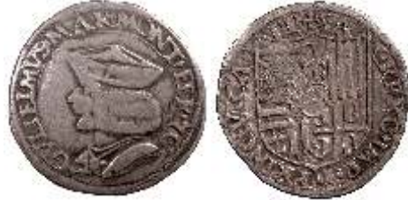
78531. ITALIAN STATES: Casale: Guglielmo II, Paleologo, 1494-1518, AR testone (8.46g), Casale-Montferrat, ND, KM-1, Varesi-185, GVLIELMVS MAR MONT FER ZC, bust left, wearing biretta / + SA CRI RO IMP PRINC VICA P P, ducal coat-of-arms, f, RR $800