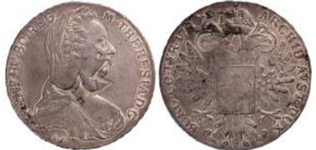
812739. NEJD: AR 20 piastres, ND (1916-20), KM-14, countermarked nejd on Maria Theresa taler, vf-ef $350 Many consider this countermark to be a spurious issue.