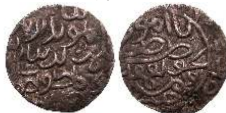
88767. BENGAL: Ahmad Shah , 1432, AR tanka (10.77g), NM, ND, G-B394, with title al-mu'ayyid bi-ta'yid al-rahman , 3 banker's marks on reverse, vf-ef, RR $400