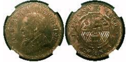
93657. SOUTH AFRICA: AE penny, 1898, KM-2, NGC graded MS63 $150

Coin image is approximately 90% of actual size.