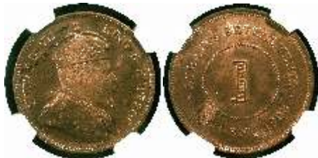
93659. STRAITS SETTLEMENTS: AE cent, 1908, KM-19, bright red luster, NGC graded MS64 $350