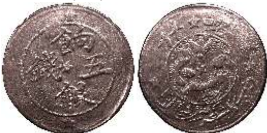
826819. SINKIANG: AR 5 miscals (16.16g), AH1329, Y-31, vf-ef $140