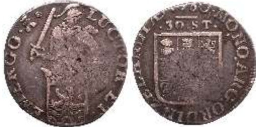
826969. Zeeland: AR 30 stuivers (12.67g), 1680, KM-53, crude f $120