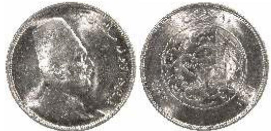
89282. EGYPT: AR 10 qirsh, 1923-H/AH1342, KM-337, unc $135