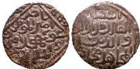
88760. BENGAL: Muhammad Shah , 1st reign, 1415-1416, AR tanka (10.07g), NM, AH818, G-B307, reverse in diamond, with date around, clearly without mint name, 4 or 5 test marks on reverse, ef, R $100