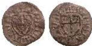
82997. Teutonic Order: Martin Truchseß , von Wetzhausen, 1477-1489, AR schilling, Saruma-5033; Neumann-29a, arms of the Grand Master / arms of the Order, with old museum writing on reverse, vf $100