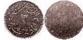
54484. EGYPT: 2 milliem, 1924-H/AH1342, KM-332, specimen uniface reverse trail strike from the archives of the King's Norton mint, PCGS graded SP-64, pf $195