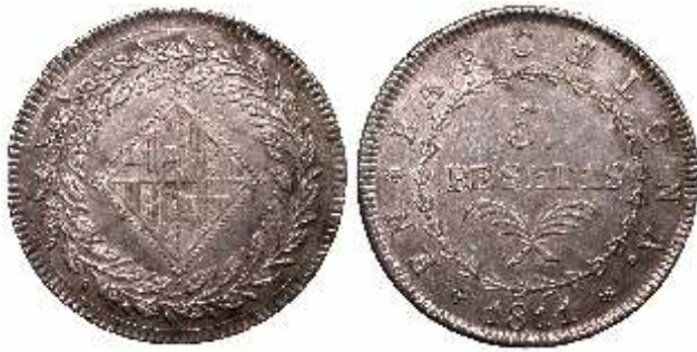
94772. SPAIN: Barcelona: AR 5 pesetas, 1811, KM-69, issue of Joseph Napoleon, lovely ef $800

Joseph-Napoléon Bonaparte held the titles of King of Naples and Sicily, King of Spain and the Indies, and Comte de Survilliers. He was the elder brother of Napoleon I of France, who made him King of Naples and Sicily and later King of Spain as Joseph I of Spain. He abdicated and returned to France after defeat at the Battle of Vitoria in 1813.