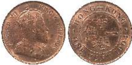
826891. HONG KONG: AE cent (7.39g), 1904 H, KM-11, choice unc $125