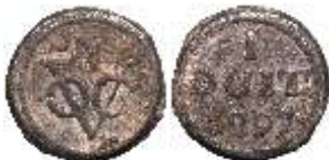
826971. NETHERLANDS EAST INDIES: tin duit (7.42g), Negapatnam, 1797, KM-179, struck for use in Java, vf $350