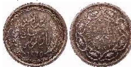
827063. TUNISIA: AR 10 francs (10.01g), AH1365/1945 (a), KM-X1, choice unc $350