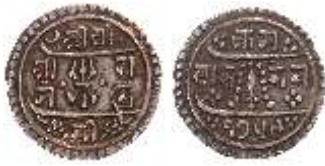
84662. NEPAL: AR ½ mohar (2.74g), SE1759, KM-564, nice vf $120