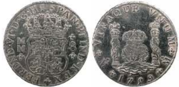
89180. MEXICO: Fernando VI, 1746-1759, AR 8 reales, 1759, KM-104.2, 'pillar dollar' or columnario , vf $200

The pillar dollar, "ocho reales", struck at the Spanish colonial mints in South and Central America from 1732 to 1771, has always been on the most popular coins amongst collectors in the United States, as together with the portrait dollar of Spanish America it became the standard currency of the United States. Technically, the United States dollar replaced the Mexican eight real coins as the US official currency only in 1857.