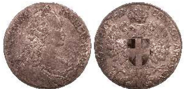
93563. ERITREA: AR tallero, 1918-R, KM-5, one year type, ef-au $425