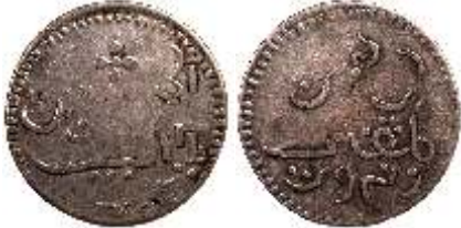
89792. JAVA: AR rupee, 1765, KM-175.1, United East India Company, Arabic script legends, f $120