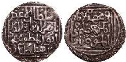
83341. BENGAL: Mahmud of Delhi , 1246-1266, AR tanka (9.79g), Lakhnauti, AH(65)9, G-B71, citing the last Abbasid caliph al-Musta'sim, interesting reverse die cracks, ef, RR $185