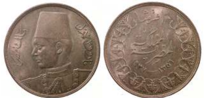
88992. EGYPT: AR 20 piastres, 1937/AH1356, KM-368, bust of King Farouk, choice unc $275