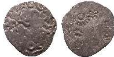
88533. KASHI: Punchmark, ca. BC 525-465, AR vimshatika (4.69g), Ra-779/80, Series 58, 5 additional marks on reverse, choice vf $125