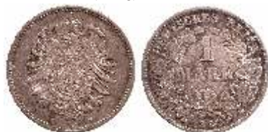
823368. GERMANY: AR mark (5.54g), 1882 H, KM-7, choice vf-ef, R $200 "H" is the mint of Darmstadt, active 1872-1882.