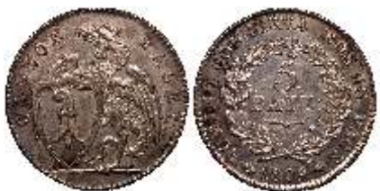
94768. SWITZERLAND: Basel: AR 5 batzen, 1809, KM-199, Cantonal issue, unc $210