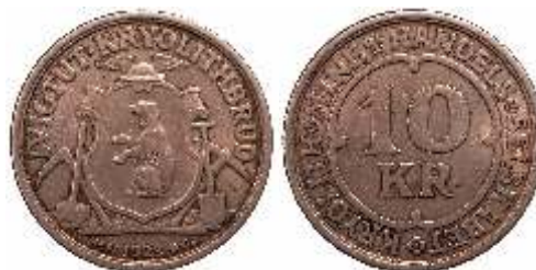
825643. GREENLAND: 10 kroner (11.52g), 1922, KM-Tn49, Ivigtut Kryolith mine token, choice ef $150