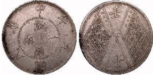
92383. SINKIANG: Republic: AR tael, year 1 (1912), Y-42a, Kann-1250, crossed ornamental flags with four arabesques in stripes, touch of hornsilver on edge, vf $675