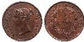
826998. STRAITS SETTLEMENTS: AE ¼ cent (2.35g), 1845, KM-1, attractive au $140

Salus Populi, "for the good of the people". "30 Sous" refers to the local denomination, equal to one duro, the local crown of the islands. Similar coins had been produced in 1808-1809, in Majorca as well as Gerona, Lerida, Tarragona & Tortosa.