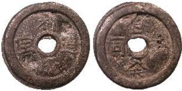
93693. LIGOR: lead ¼ bia (20.05g), ND (ca. 1880-95), Pridmore-233cf, Li Ch'eng Tung Bao , abbreviated Bao , with two additional Chinese countermarks, Ta Ts'ai (great quality or genuine) in field / Ho Fah Kung Ssü (United Prosperous Company), vf, RRR $325 This type unpublished by Pridmore.