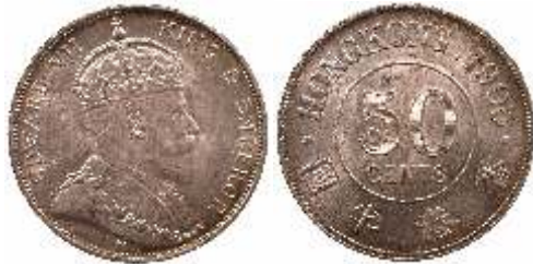
826892. HONG KONG: AR 50 cents (13.56g), 1905, KM-15, au $250