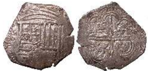
87174. SPAIN: Felipe II, 1556-1598, AR 4 reales (13.78g), Granada (15)95, CC-3867, ef $350