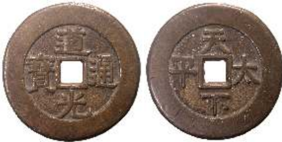
87262. CH'ING: Dao Guang , 1821-1850, AE charm, CCH-288, tian xia tai ping (peace under heaven), "curtain hanging money", f-vf, S $100

Coin image is approximately 80% of actual size.