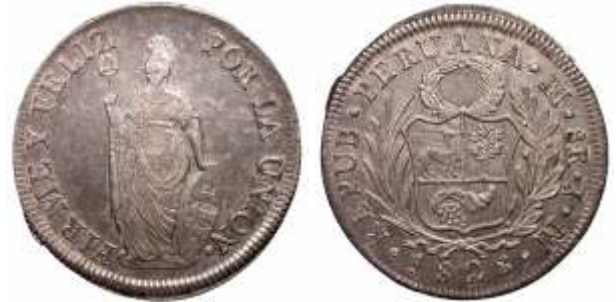
94746. PERU: AR 8 reales, Lima, 1828, KM-142.3, assayer JM, bold strike, ef-au $275