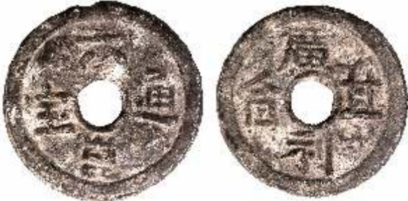
93757. LIGOR: lead ¼ bia (23.60g), ND (ca. 1880-95), Pridmore-226, Lu K'un Tung Pao (Money of Lakhon [Ligor]), abbreviated pao / Kuang Li Ch'i Ho , with two Chinese chopmarks on reverse hé hé , f-vf, RR $275 Pridmore mentions that no specimen of this type has been traced for examination or illustration.