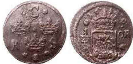
87251. SWEDEN: AE ¼ öre, Nyköping, 1634, KM-152.1, choice ef $115