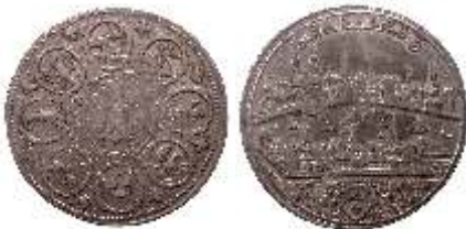
67340. Basel: AR 1/4 thaler, ND (1739), KM-166, ornate view of the city on both sides of the river Rhein, vf-ef $200