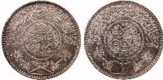
826889. HEJAZ & NEJD: AR riyal (23.96g), AH1348, KM-12, ef $350