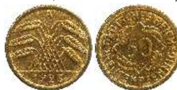
823422. GERMANY: AL-BZ 50 rentenpfennig (5.00g), 1923 A, KM-34, choice bu $100

Normal issues of 50 pfennig were struck 1875-1878, the last year very rare, followed by a limited edition 1896-1903, all very rare. Normal production of this denomination resumed in 1905, as 1/2 mark rather than 50 pfennig.