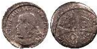
825721. Barcelona: AR croat (2.11g), 1706, KM-PT1, issue of Carlos III, pretender, f $100

Joseph-Napoléon Bonaparte held the titles of King of Naples and Sicily, King of Spain and the Indies, and Comte de Survilliers. He was the elder brother of Napoleon I of France, who made him King of Naples and Sicily and later King of Spain as Joseph I of Spain. He abdicated and returned to France after defeat at the Battle of Vitoria in 1813.