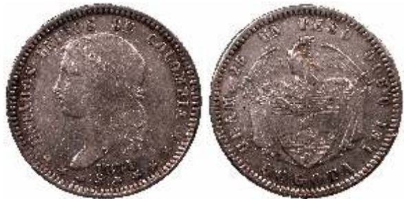
90184. COLOMBIA: AR peso, Bogota, 1871, KM-154.1, some minor rim bumps, scarce type, vf-ef $280