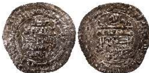
87976. SAMANID: Nuh III , 976-997, AR dirham (3.17g), al-Shash, AH375, A-1470, SNAT—, citing husâm al-dawla below obverse, words yathiqu billâh below reverse, bold strike, possibly unpublished, ef, R $125