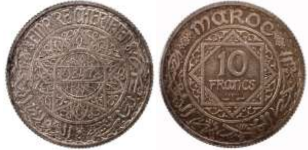
826961. MOROCCO: AR 10 francs (10.04g), Paris, AH1347 (a), Y-E23, Essai of Y-38, unc $300