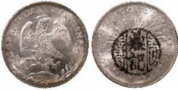
94737. MEXICO: AR 8 reales, 1893-Zs, KM-377.13, with Chinese ink chop with four characters, two in seal script and two in orthodox script, choice bu, RR $350 This is the finest example of an ink chopmark we have encountered in some time.