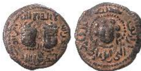
821953. ARTUQIDS OF MARDIN: Alpi , 1152-1176, AE dirham (11.73g), NM, ND (AH560-6), A-1827.5, SS-30.1, two facing male heads / facing female head, in name of al-Mustanjid, vf $100