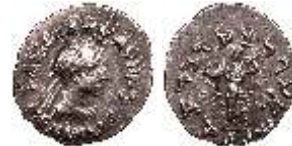
93287. INDO-GREEK: Menander I, ca. 165-130 BC, AR drachm (2.48g), Chach, Mitch-1772, diademed & draped bust right, Greek legend / Kharosthi legend, Athena Alkidemos advancing left, hurling thunderbolt and raising shield; monogram in right field, double struck obverse, ef $125