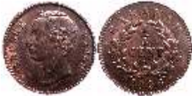
88568. SARAWAK: AE 1/4 cent, 1896H, KM-4, Charles J. Brooke Rajah, PCGS graded MS63 BN $250