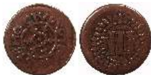
826875. Wiedenbrück: AE 3 pfennig (3.04g), 1678, KM-26, f $125