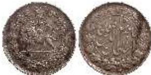
83335. IRAN: AR 500 dinars, Tehran, AH1293, KM-Pn14, pattern, ef, R $650