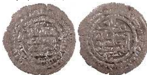
76479. SAMANID: Nuh III , 976-997, AR dirham (3.25g), Balkh, AH385, A-1470, SNAT-659/660, ef-au $110