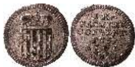
88329. Schwarzenberg: BI kreuzer (0.76g), 1765 SNR, KM-60, NACH DEM CONVENT. FUS., struck at Nürnberg (marked by N in SNR below reverse), au, R $150