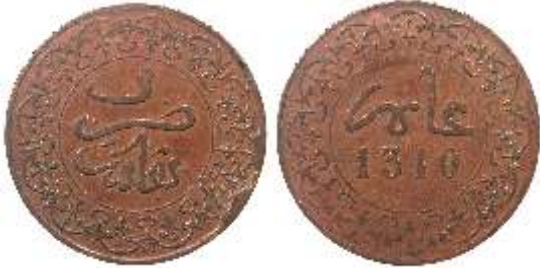
826939. MOROCCO: AE 4 falus (11.37g), Fès mint, AH1310, Y-3, two interesting cuds at obverse rim, choice vf $175