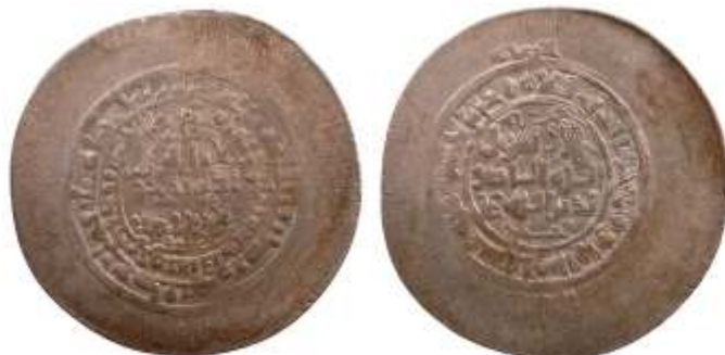
86347. AMIR OF WARWARLIZ: al-Nasir li-din Allâh 'Ali , 985, AR multiple dirham, Walwaliz (sic), AH374, A-1476S, SNAT-1251/53, 9.27g, citing Hubb bin Muhammad on obverse, Qur'an 6:160 in reverse margin, bold strike, choice ef $300