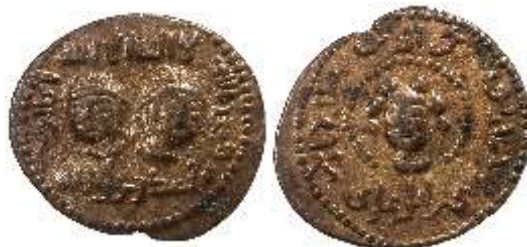
89221. ARTUQIDS OF MARDIN: Alpi , 1152-1176, AE dirham (12.37g), NM, ND, A-1827.5, SS-30.1, facing male heads (Gemini) / facing female head (Virgo), in name of al-Mustanjid on right side of obverse, vf $110