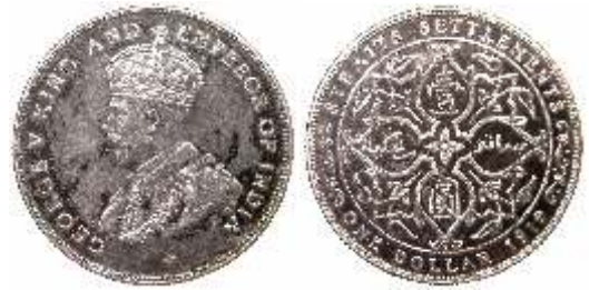
827002. STRAITS SETTLEMENTS: AR dollar (16.90g), 1919, KM-33, pf restrike $200