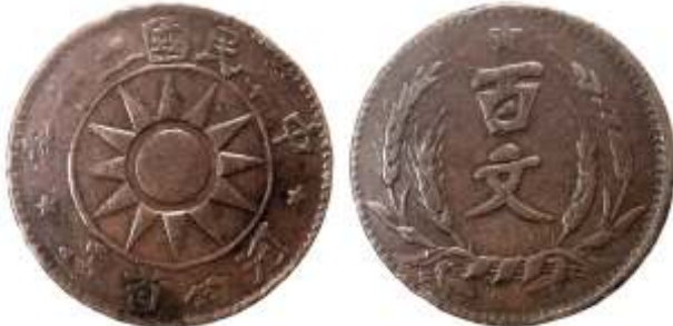
51327. HONAN: AE 100 cash, year 20 (1931), Y-398, vf $150