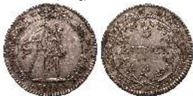
827023. Helvetian Republic: AR 5 batzen (4.65g), 1799 B, KM-A9, ef $100 The Helvetian Republic was established after the Napoleonic occupation of Switzerland in 1798 and lasted until 1803.