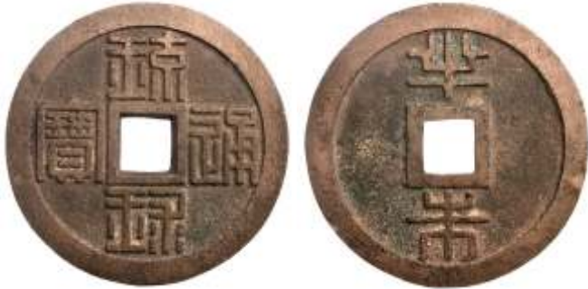
85985. RYUKYU ISLANDS: AE 1/2 shu, ND (1862), Cr-115, provincial coinage, vf-ef $190

The Ryukyu islands of Japan are a lengthy series of mostly small islands stretching from just south of the Kyushu province almost to the Tropic of Cancer near Taiwan. It is also known as Nanseu Shoto, "south islands", of which the most famous is Okinawa.