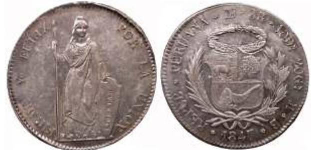
94745. PERU: AR 8 reales, Lima, 1847, KM-142.10, assayer MB, 7 over 6 in date, strong strike, ef $450