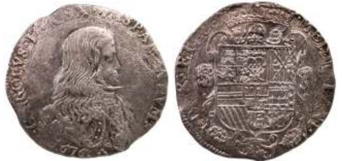
91043. Milan: AR filippo, 1676, Dav-4005, bust of Charles II right / arms, choice vf $500