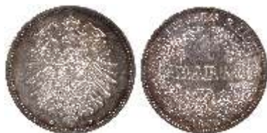
823354. GERMANY: AR mark (5.53g), 1873 D, KM-7, choice au $125