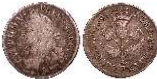
826993. SCOTLAND: William II, 1689-1702, AR 5 shilling (2.27g), 1695, KM-140, f-vf $190