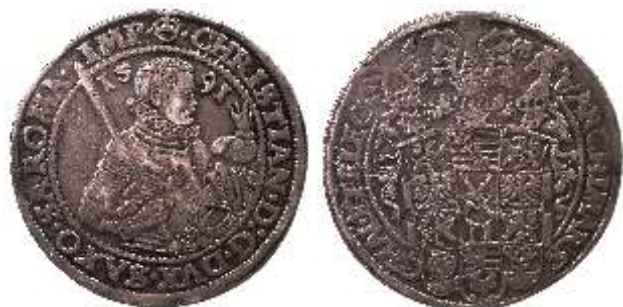
826872. Saxon-Albertine: Christian II , 1586-1591, AR taler (28.91g), Dresden, 1591 HB, KM-MB251, Dav-9806, vf $325