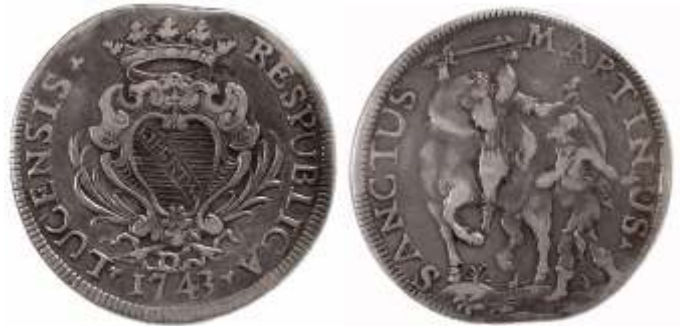
2385. Lucca: AR scudo, 1743, KM-53, Dav-1373, crowned coat of arms. / Saint Martin of Tours shares his cloak, f $285