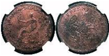
93661. CANADA: AE 1/2 penny token, 1815, LC-54D2, seated Britannia left / facing American eagle, NGC graded MS61 $275