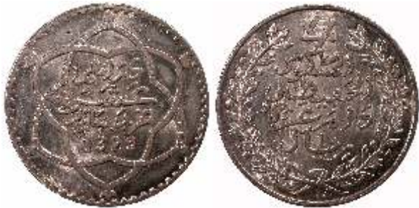
826950. MOROCCO: AR 10 dirhams (25.01g), Paris mint, AH1329, Y-25, choice au $250