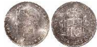
825720. SPAIN: Alfonso XIII, 1874-1931, AR peseta (4.95g), Madrid, 1896 PGV, KM-706, choice unc $115