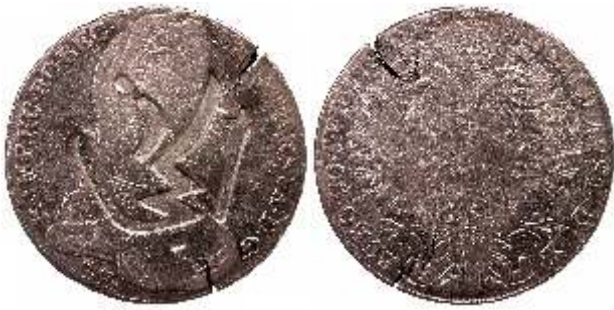
812629. HEJAZ: AR 20 piastres, ND (1916-20), KM-18var, countermarked al-Hejaz on Maria Theresa taler, crude vf-ef $400 This countermark is considered by many to be a spurious issue.