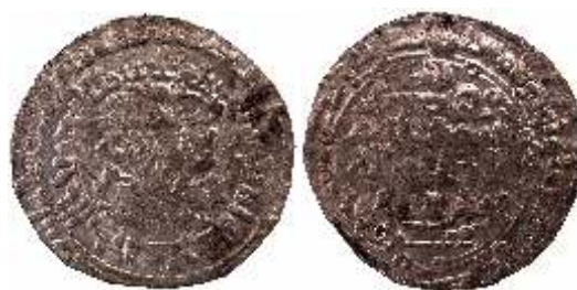
86984. SAMANID: Nuh III , 976-997, AR dirham (3.85g), Balkh, AH374, A-1470, SNAT—, with title al-malik al-mansur on obverse, muhammad on reverse, traces of original lustre, choice ef $100 Muhammad on reverse is reported only for AH375 in SNAT.