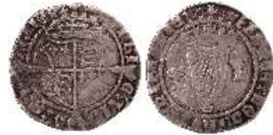
83008. IRELAND: Henry VIII, 1509-1547, AR groat, S-6472, with Jane Seymore, 1536-37, f $200