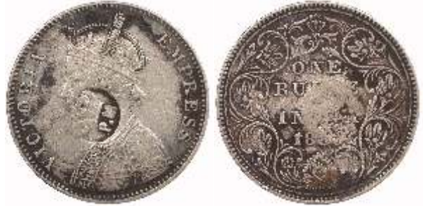
90177. MOZAMBIQUE: AR rupee, ND [1889], KM-41.2, crowned PM countermarked on British India 1888-B rupee, vf $150