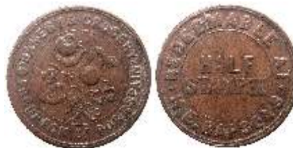
83027. TRINIDAD: AE half stampee token, ND (ca. 1861), Pridmore-5; Lyall-508, H.E. Rapseys, Port of Spain, f-vf, RR, ex. W.J. Noble Collection, Sale 61B (lot 1372) and Ex F. Pridmore (lot 384) Collection with ticket $350