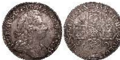
85993. GREAT BRITAIN: George I , 1714-1727, AR shilling, 1723, KM-539.3, struck from South Sea Company silver, indicated by the letters SS C SS C on the reverse, minor natural flan flaw, lustrous au $250