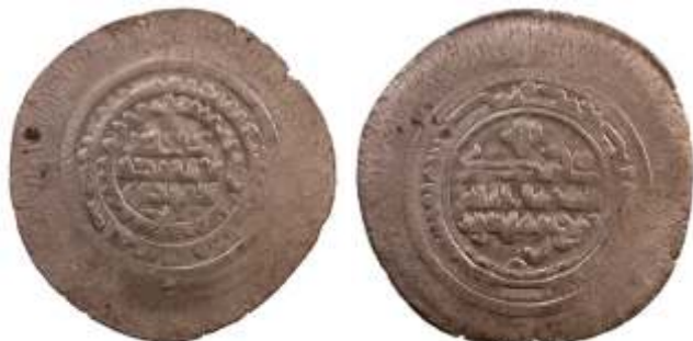
84956. SAMANID: Nuh III , 976-997, AR multiple dirham, [Ma'dan], ND, A-1469.2, SNAT—, 8.45g, annulet surrounded by about 8 pellets atop obverse margin, seems unpublished, lustrous au $100