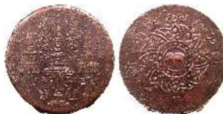
94769. THAILAND: AE 1/2 fuang, ND (1866), Y-4, with Thai and Chinese legends, crude ef-au, R $165