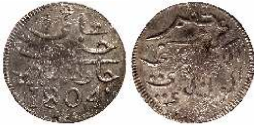
89787. JAVA: AR rupee, 1804, KM-214, Batavian Republic issue in Arabic script, crude ef $225