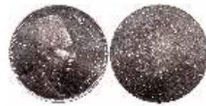
54483. EGYPT: 2 milliem (1924-H/AH1342), KM-332, specimen uniface obverse trail strike from the archives of the King's Norton mint, PCGS graded SP-63, pf $185