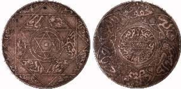
92466. MOROCCO: AR 10 dirhams, Berlin mint, AH1313, Y-13. Dav-48, vf-ef $450