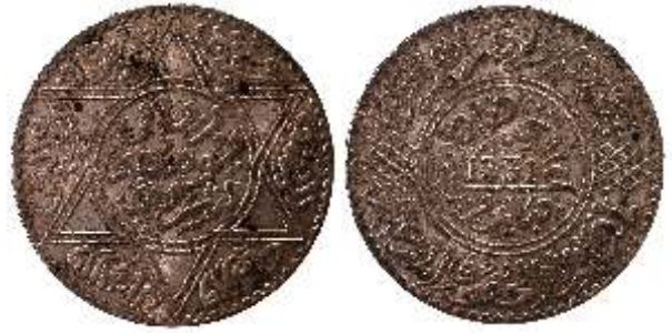
826956. MOROCCO: AR 10 dirhams (24.95g), Paris, AH1331, Y-33, choice ef $225