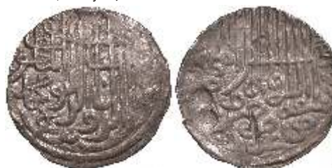
88840. BENGAL: Muhammad Shah , 2nd reign, 1418-1432, AR tanka (10.70g), Chatgaon, AH832, G-B365, toughra on both sides, 5 banker's marks on reverse, nearly ef, R $185