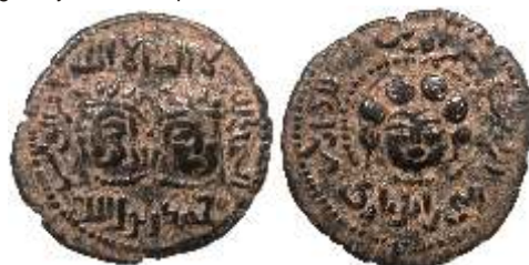
91822. ARTUQIDS OF MARDIN: Alpi , 1152-1176, AE dirham (10.61g), NM, ND, A-1827.5, SS-30, two facing male busts obverse, facing curly-haired female bust reverse, lovely brown patina, strong vf $160